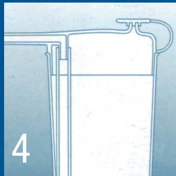
4 After the first sip, the cup is spill-proof.