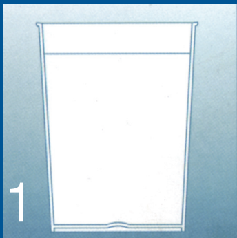
1 Fill the Novo Cup with liquid as required.