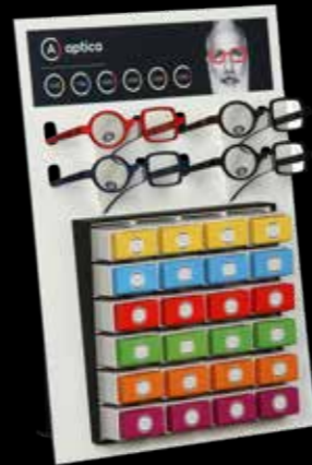
Box Palbo Desk display

Blue light does not add anything to complete the visual acuity, unlike other parts of the light spectrum, on the contrary, it can lead to eye fatigue.