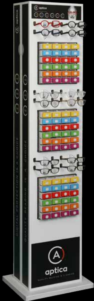
Box Rebo Floor display