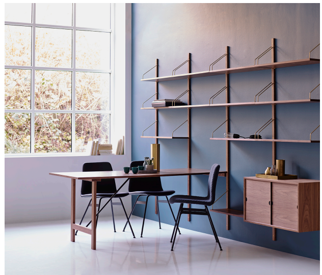
Table (L) H72 or 109 cm., 80 x 175 cm.

For more information and pictures, please visit www.dk3.dk under "press / downloads" or contact us at info@dk3.dk / tel. 0045 7070 2170.