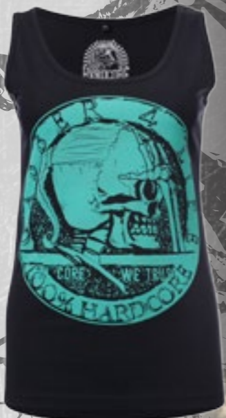
LADY SINGLET ART.NR.: 355-070-420 SIZE: XS-S-M-L-XL-XXL