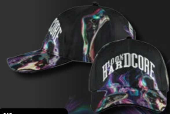
CAP ART.NR.: 330-C120-050 SIZE: ONE SIZE