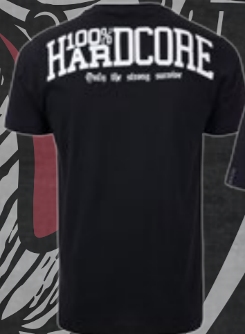
T-SHIRT ART.NR.: 305-254-050 SIZE: S-M-L-XL-XXL-XXXL