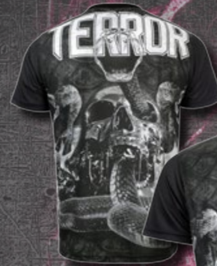
T-SHIRT ART.NR.: 805-049-050 SIZE: S-M-L-XL-XXL-XXXL