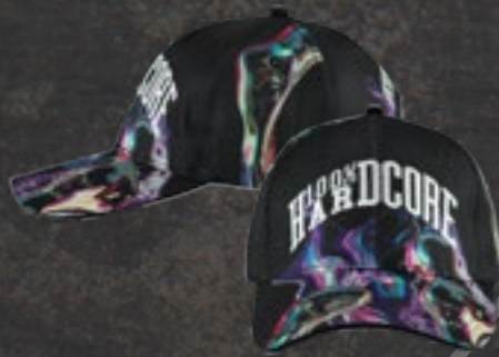
CAP ART.NR.: 330-C120-050 SIZE: ONE SIZE