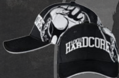
CAP ART.NR.: 330-C105-050 SIZE: ONE SIZE