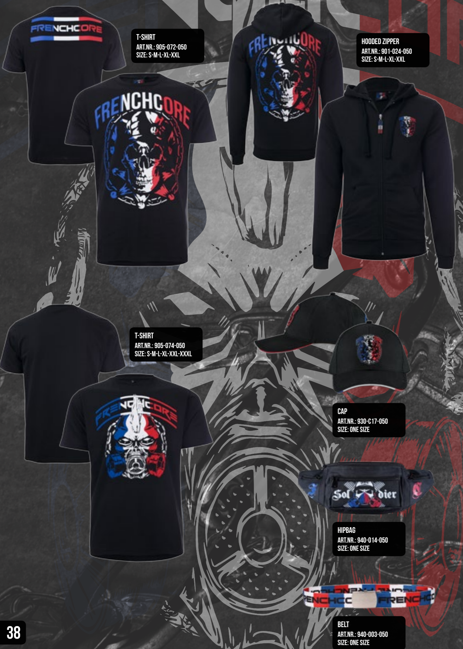
T-SHIRT ART.NR.: 905-072-050 SIZE: S-M-L-XL-XXL