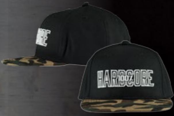
CAP SNAPBACK ART.NR.: 330-C121-050 SIZE: ONE SIZE