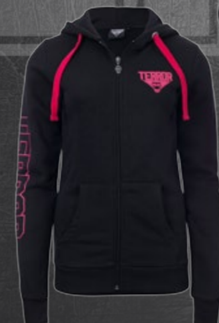
LADY HOODED ZIPPER ART.NR.: 851-B02-050 SIZE: S-M-L-XL-XXL