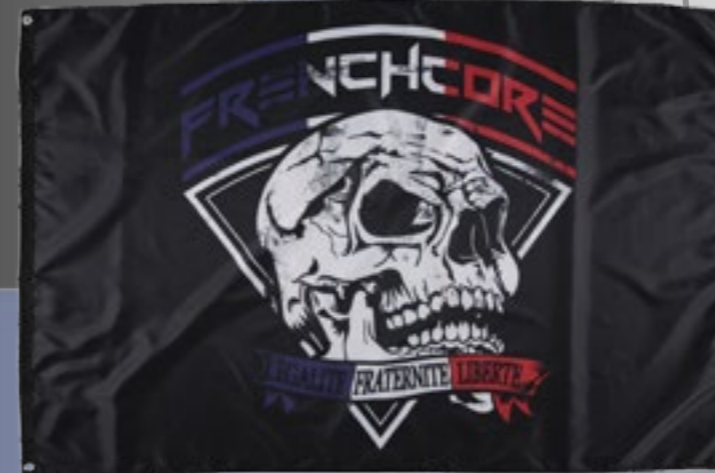
BANNER ART.NR.: 960-013-050 SIZE: 150 CM X 100 CM