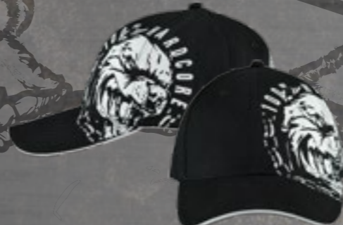
CAP ART.NR.: 330-C119-050 SIZE: ONE SIZE