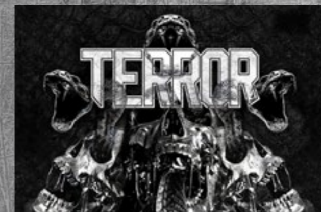
BANNER ART.NR.: 860-013-050 SIZE: 150 CM X 100 CM