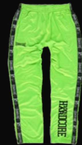
TRAINING PANTS ART.NR.: 315-001-400 SIZE: XS-S-M-L-XL-XXL