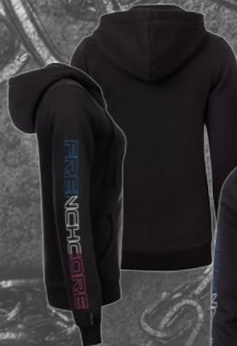
LADY HOODED ZIPPER ART.NR.: 951-B02-050 SIZE: S-M-L-XL-XXL