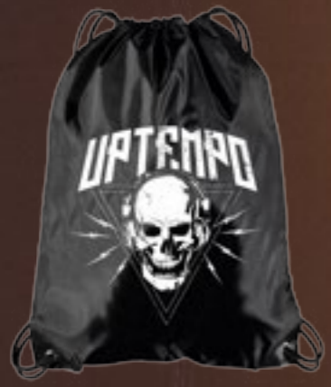
STRINGBAG ART.NR.: 375-SB05-050 SIZE: ONE SIZE