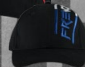
CAP ART.NR.: 930-C18-050 SIZE: ONE SIZE