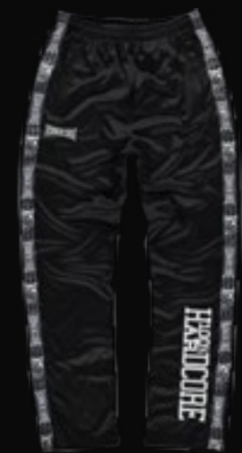
TRAINING PANTS ART.NR.: 315-002-050 SIZE: XS-S-M-L-XL-XXL