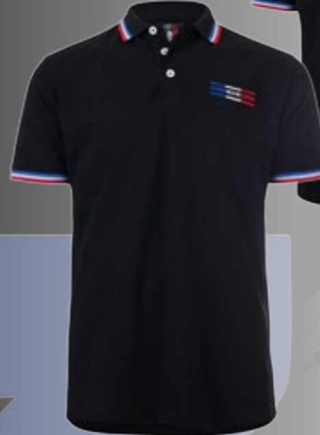
POLO ART.NR.: 918-020-050 SIZE: S-M-L-XL-XXL-XXXL