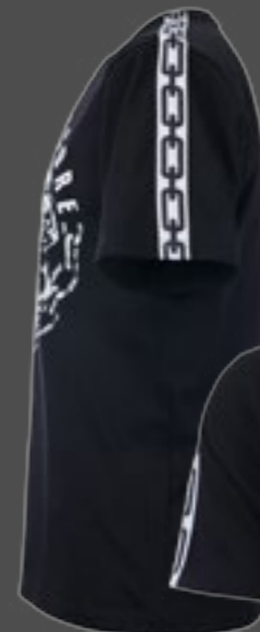
T-SHIRT ART.NR.: 305-272-050 SIZE: S-M-L-XL-XXL-XXXL