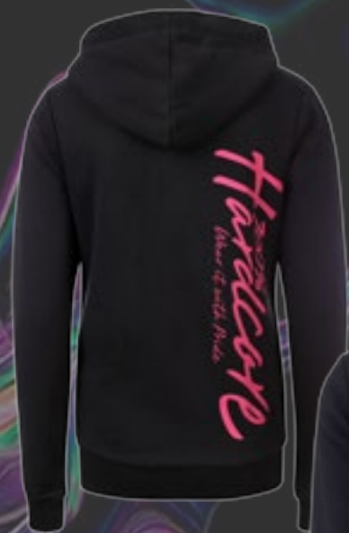
HOODED ZIPPER ART.NR.: 351-B02-050 SIZE: S-M-L-XL