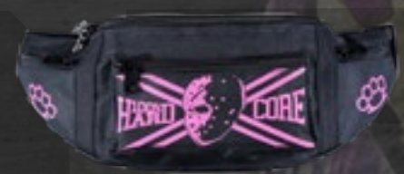
HIPBAG ART.NR.: 340-046-160 SIZE: ONE SIZE