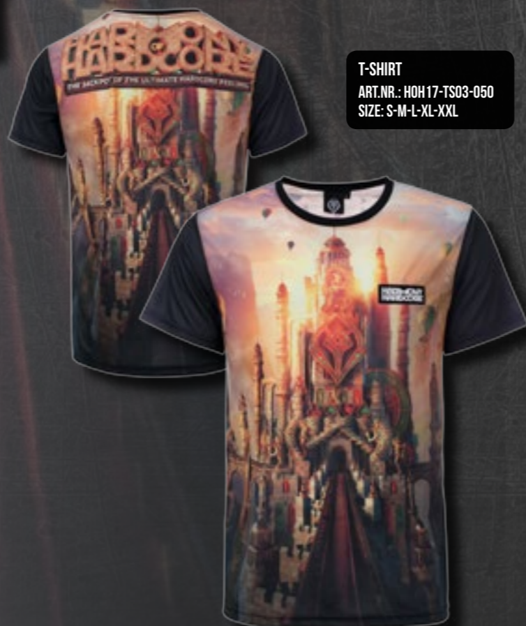
T-SHIRT ART.NR.: HOH17-TS03-050 SIZE: S-M-L-XL-XXL