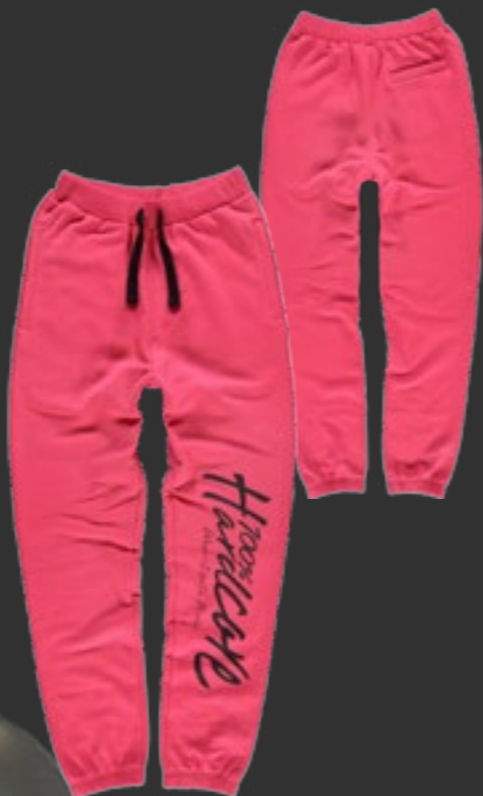
JOGGING PANTS ART.NR.: 353-010-160 SIZE: XS-S-M-L-XL-XXL