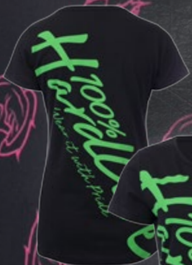
T-SHIRT ART.NR.: 355-B04-400 SIZE: XS-S-M-L-XL-XXL