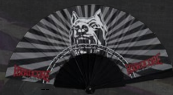
FAN ART.NR.: 340-W36-050 SIZE: ONE SIZE