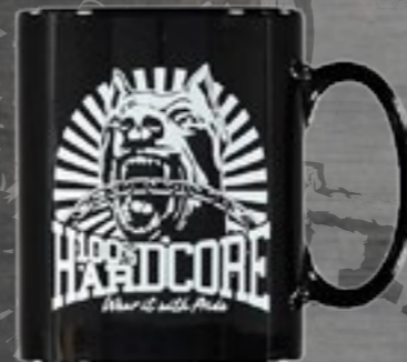
MUG ART.NR.: 375-CC1-050 SIZE: ONE SIZE