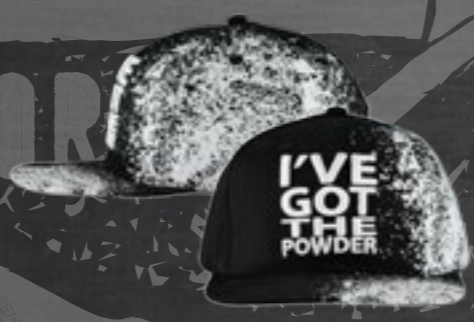
CAP SNAPBACK ART.NR.: 330-C117-050 SIZE: ONE SIZE