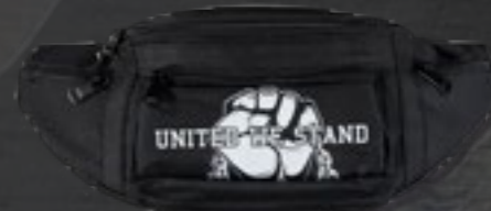
HIPBAG ART.NR.: 340-038-050 SIZE: ONE SIZE