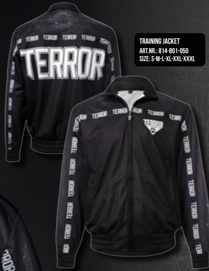
TRAINING JACKET ART.NR.: 814-B01-050 SIZE: S-M-L-XL-XXL-XXXL