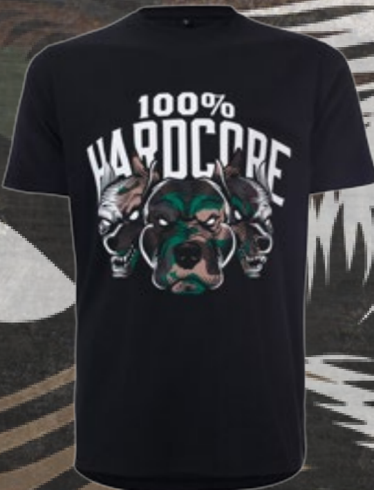
T-SHIRT ART.NR.: 305-278-400 SIZE: S-M-L-XL-XXL-XXXL