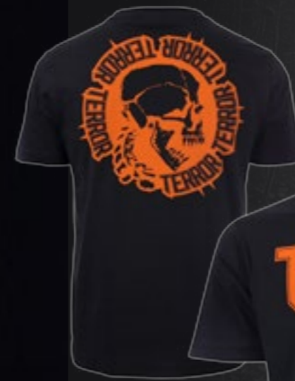
T-SHIRT ART.NR.: 805-053-030 SIZE: S-M-L-XL-XXL-XXXL