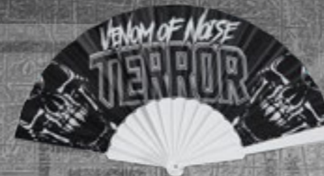
FAN ART.NR.: 840-W7-050 SIZE: ONE SIZE