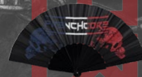
FAN ART.NR.: 940-W7-050 SIZE: ONE SIZE