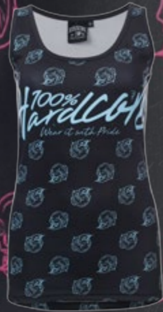
SINGLET ART.NR.: 355-B03-230 SIZE: S-M-L-XL