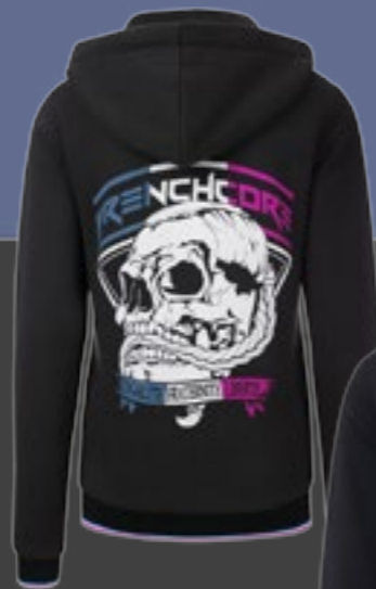
LADY HOODED ZIPPER ART.NR.: 951-012-050 SIZE: XS-S-M-L-XL-XXL