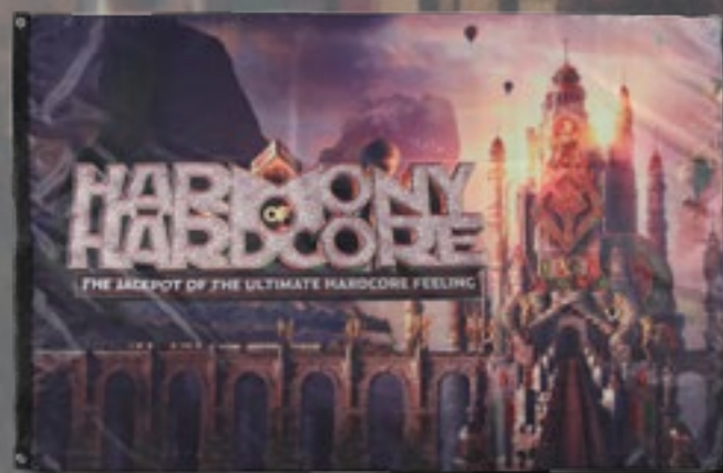
BANNER ART.NR.: HOH17-BN02-050 SIZE: 150 CM X 100 CM