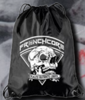
STRINGBAG ART.NR.: 975-SB03-050 SIZE: ONE SIZE