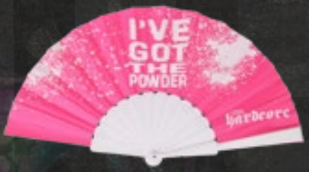
FAN ART.NR.: 340-W3-160 SIZE: ONE SIZE