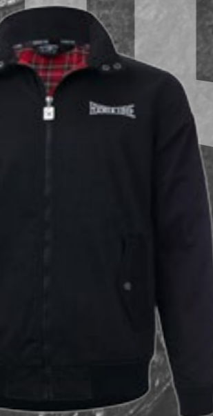
HARRINGTON JACKET ART.NR.: 315-347-050 SIZE: S-M-L-XL-XXL-XXXL