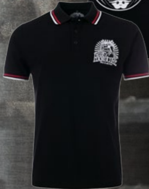
POLO ART.NR.: 318-018-050 SIZE: S-M-L-XL-XXL-XXXL