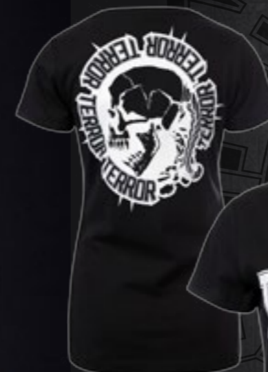
LADY T-SHIRT ART.NR.: 855-002-050 SIZE: XS-S-M-L-XL-XXL