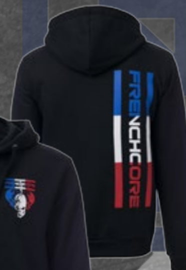
HOODED ZIPPER ART.NR.: 901-B02-050 SIZE: S-M-L-XL-XXL-XXXL