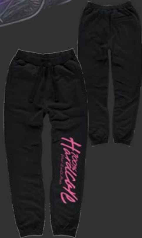
JOGGING PANTS ART.NR.: 353-010-050 SIZE: S-M-L-XL