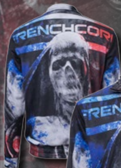
TRAINING JACKET ART.NR.: 914-009-050 SIZE: S-M-L-XL-XXL