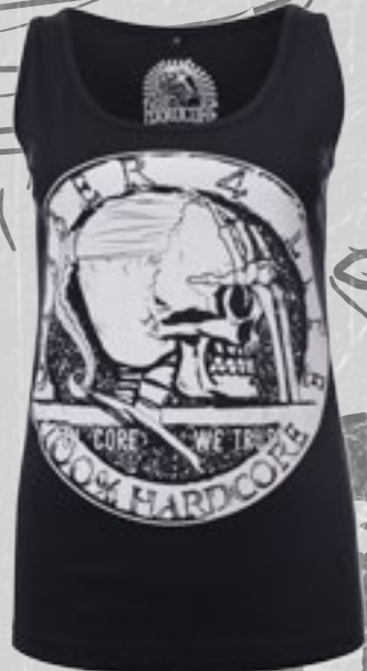
LADY SINGLET ART.NR.: 355-070-050 SIZE: XS-S-M-L-XL-XXL