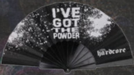
FAN ART.NR.: 340-W3-050 SIZE: ONE SIZE