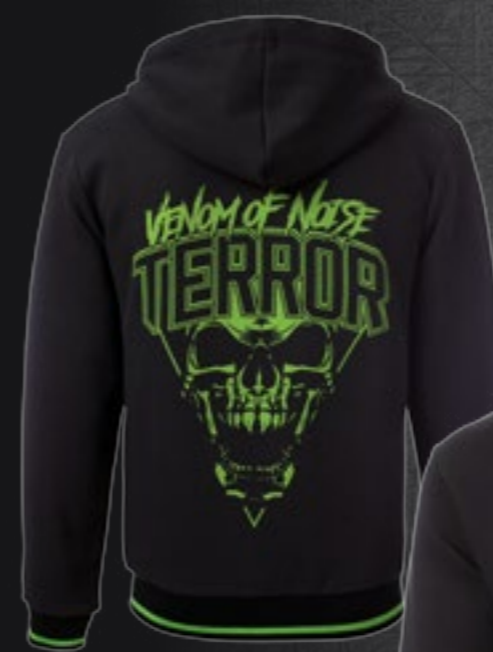
HOODED ZIP MASK ART.NR.: 801-011-400 SIZE: S-M-L-XL-XXL-XXXL