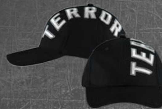
CAP ART.NR.: 830-C15-050 SIZE: ONE SIZE