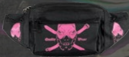
HIPBAG ART.NR.: 340-040-160 SIZE: ONE SIZE