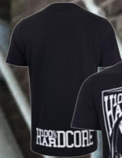
T-SHIRT ART.NR.: 305-270-050 SIZE: S-M-L-XL-XXL-XXXL