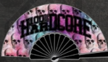
FAN ART.NR.: 340-W21-DREAM SIZE: ONE SIZE