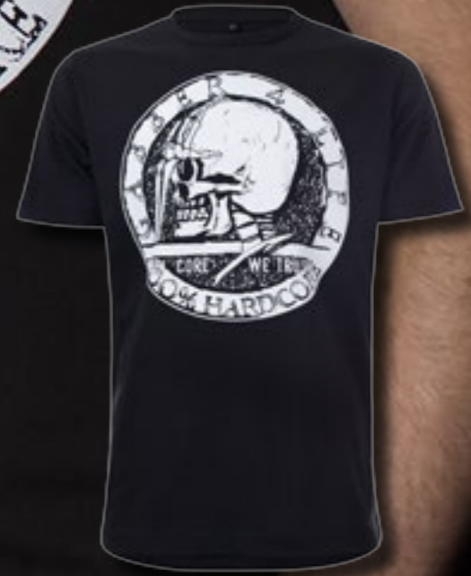
T-SHIRT ART.NR.: 305-274-050 SIZE: S-M-L-XL-XXL-XXXL