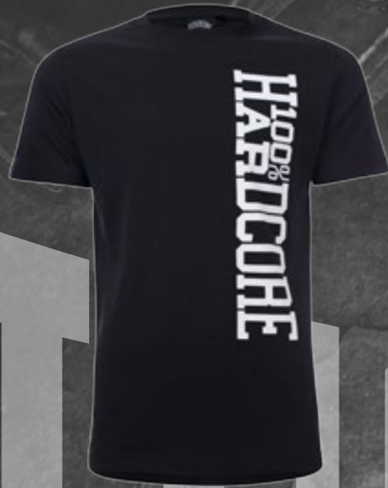
T-SHIRT ART.NR.: 305-B02-050 SIZE: S-M-L-XL-XXL-XXXL