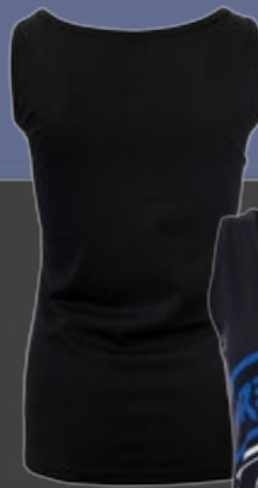
LADY SINGLET ART.NR.: 955-062-050 SIZE: XS-S-M-L-XL-XXL