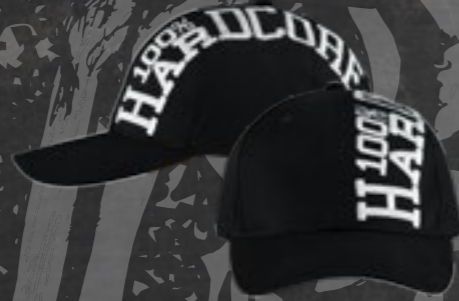
CAP ART.NR.: 330-C115-050 SIZE: ONE SIZE