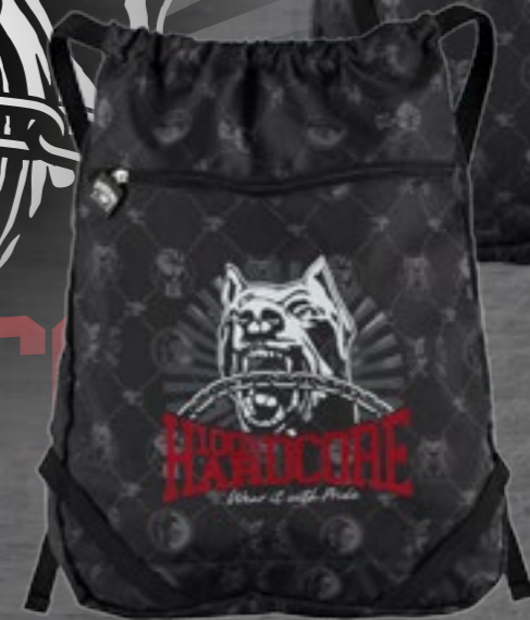
GYMBAG ART.NR.: 375-GB01-050 SIZE: ONE SIZE