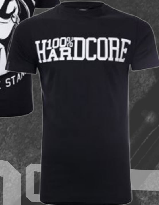
T-SHIRT ART.NR.: 305-240-050 SIZE: S-M-L-XL-XXL-XXXL