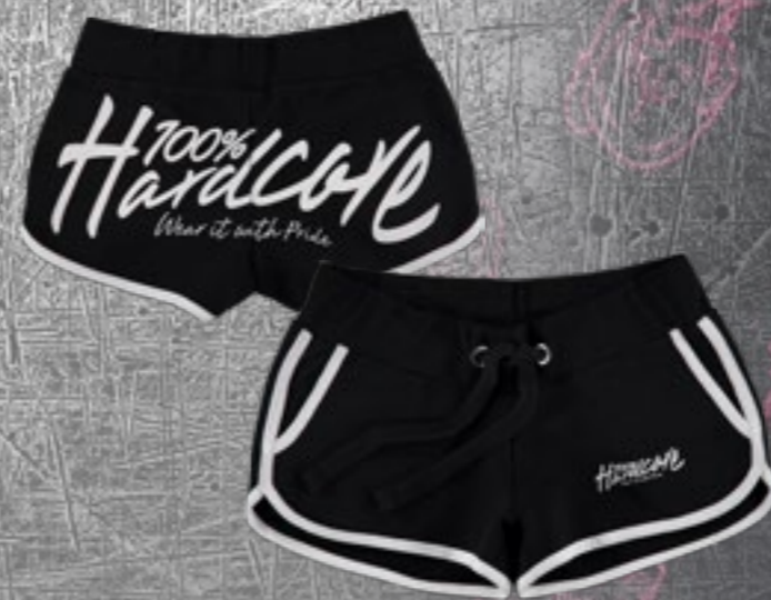
HOTPANTS ART.NR.: 350-002-050 SIZE: XS-S-M-L-XL-XXL