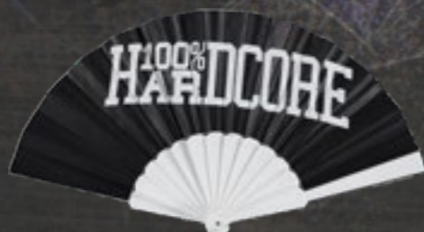
FAN ART.NR.: 340-W37-050 SIZE: ONE SIZE