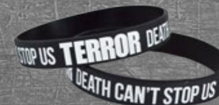
WRISTBAND ART.NR.: TE-WB01-050 SIZE: ONE SIZE