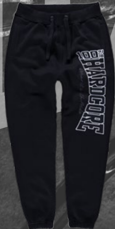
JOGGING PANTS ART.NR.: 315-014-050 SIZE: S-M-L-XL-XXL