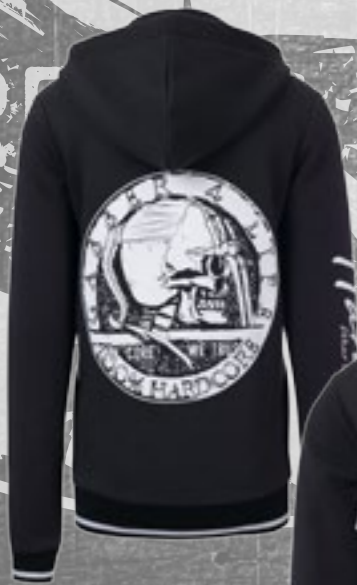
LADY HOODED ZIPPER ART.NR.: 351-003-050 SIZE: XS-S-M-L-XL-XXL