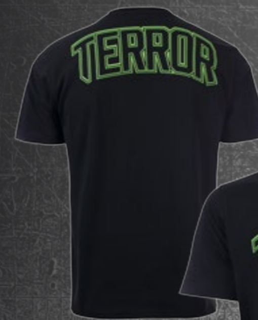
T-SHIRT ART.NR.: 805-055-400 SIZE: S-M-L-XL-XXL-XXXL