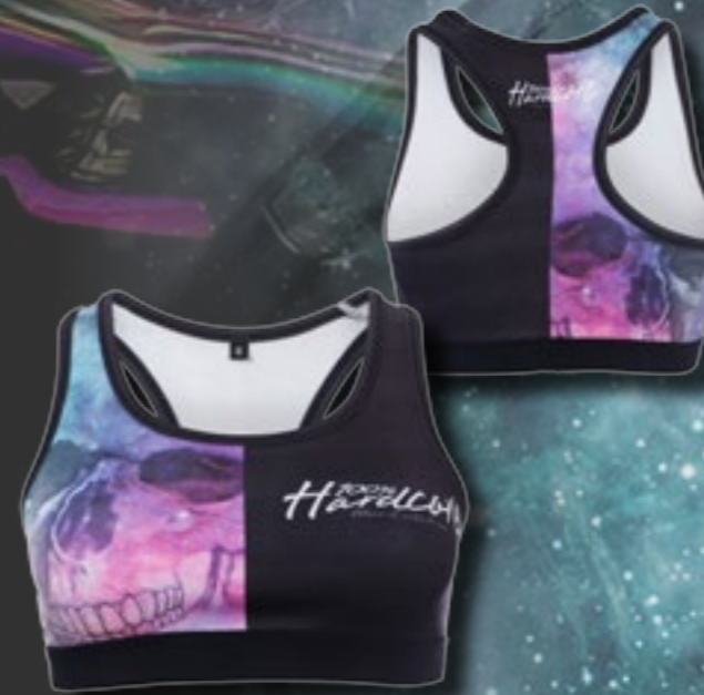
SPORT TOP ART.NR.: 355-BAND-DREAM SIZE: XS-S-M-L-XL-XXL