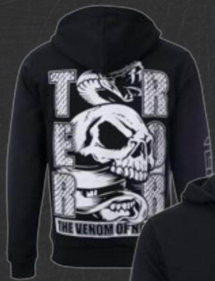
HOODED ZIPPER ART.NR.: 801-010-050 SIZE: M-L-XL-XXL-XXXL