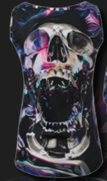
SINGLET ART.NR.: 355-067-LT SIZE: XS-S-M-L-XL-XXL