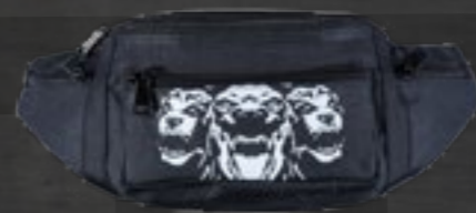
HIPBAG ART.NR.: 340-044-050 SIZE: ONE SIZE