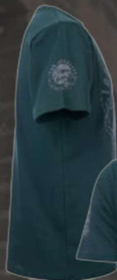
T-SHIRT ART.NR.: 305-272-400 SIZE: S-M-L-XL-XXL-XXXL