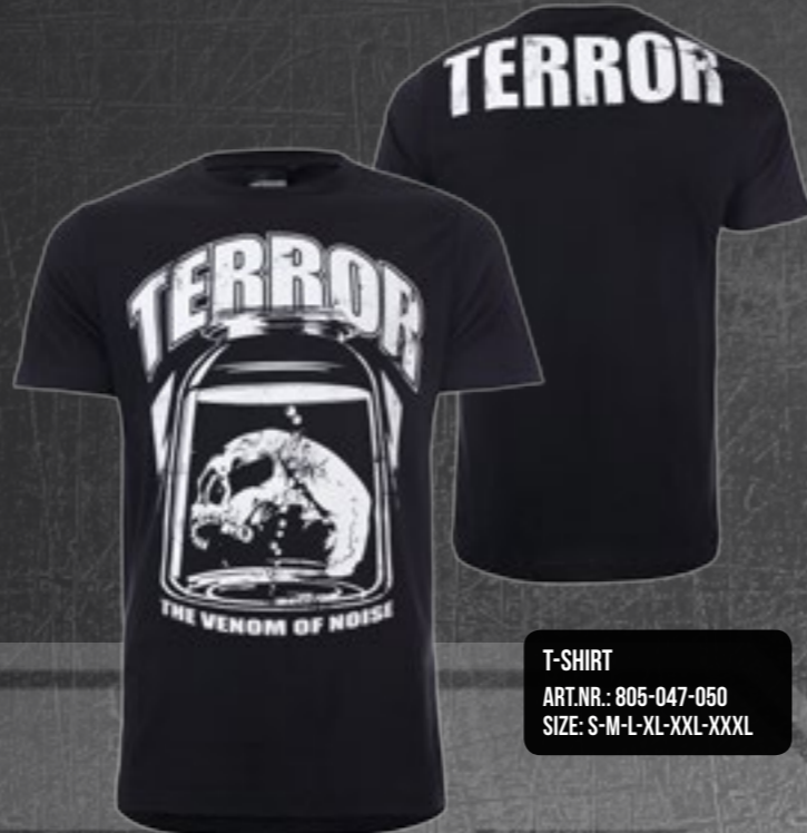
T-SHIRT ART.NR.: 805-047-050 SIZE: S-M-L-XL-XXL-XXXL