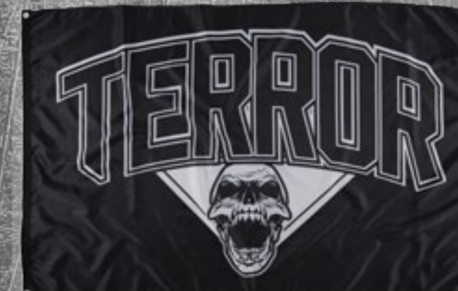
BANNER ART.NR.: 860-015-050 SIZE: 150 CM X 100 CM