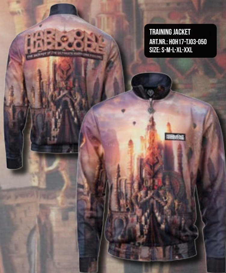
TRAINING JACKET ART.NR.: HOH17-TJ03-050 SIZE: S-M-L-XL-XXL