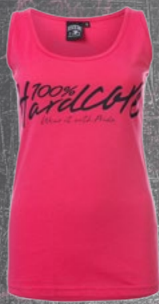
SINGLET ART.NR.: 355-B02-160 SIZE: S-M-L-XL-XXL