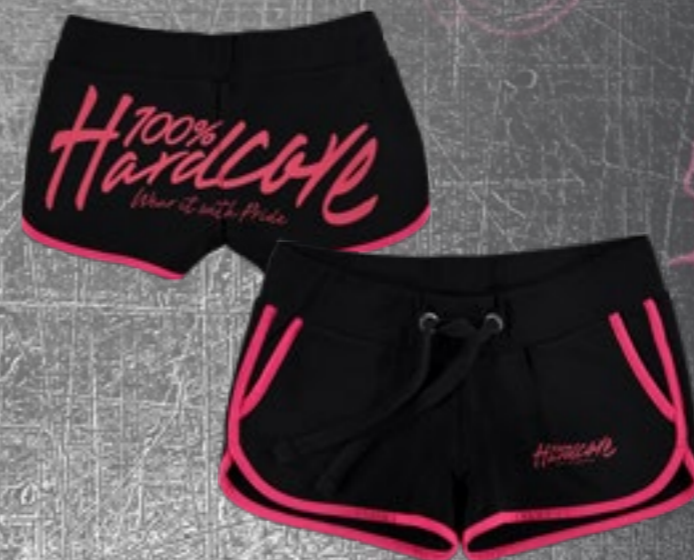
HOTPANTS ART.NR.: 350-002-160 SIZE: XS-S-M-L-XL-XXL