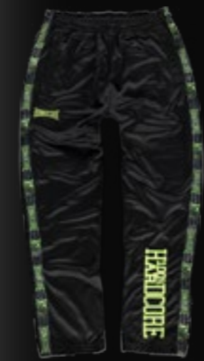
TRAINING PANTS ART.NR.: 315-001-450 SIZE: XS-S-M-L-XL-XXL