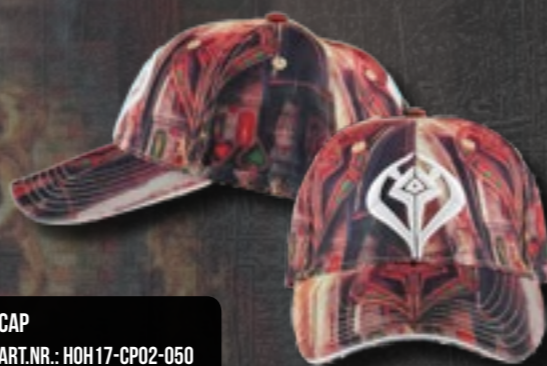
CAP ART.NR.: HOH17-CP02-050 SIZE: ONE SIZE