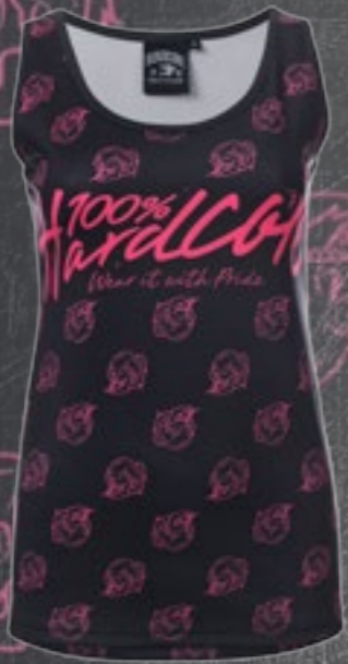
SINGLET ART.NR.: 355-B03-050 SIZE: XS-S-M-L-XL-XXL