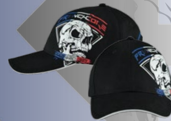
CAP ART.NR.: 930-C19-050 SIZE: ONE SIZE