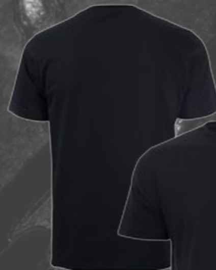
T-SHIRT ART.NR.: 905-B02-050 SIZE: S-M-L-XL-XXL-XXXL