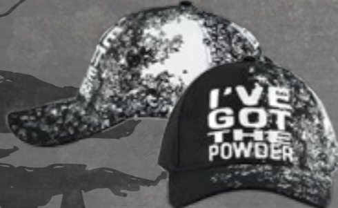
CAP ART.NR.: 330-C21-050 SIZE: ONE SIZE