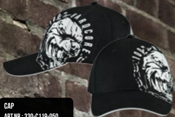
CAP ART.NR.: 330-C119-050 SIZE: ONE SIZE