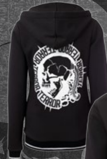
LADY HOODED ZIPPER ART.NR.: 851-001-050 SIZE: XS-S-M-L-XL-XXL