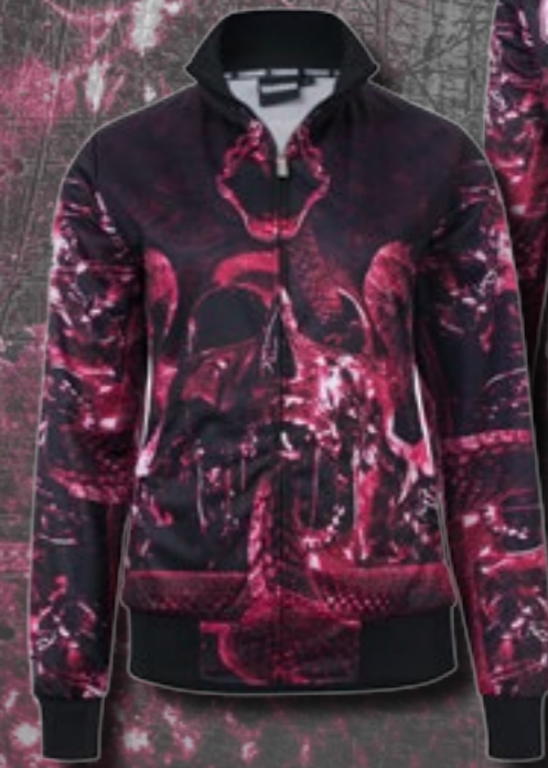
TRAINING JACKET UNISEX ART.NR.: 814-009-160 SIZE: M-L-XL-XXL