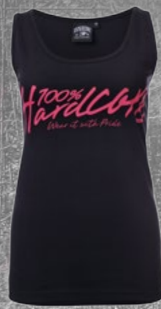
SINGLET ART.NR.: 355-B02-050 SIZE: S-M-L-XL-XXL