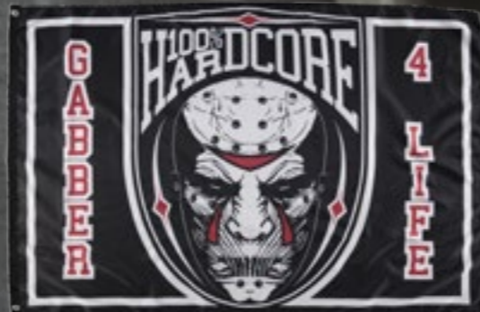
BANNER ART.NR.: 360-039-050 SIZE: 150 X 100 CM