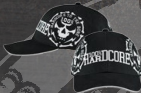
CAP ART.NR.: 330-C116-050 SIZE: ONE SIZE