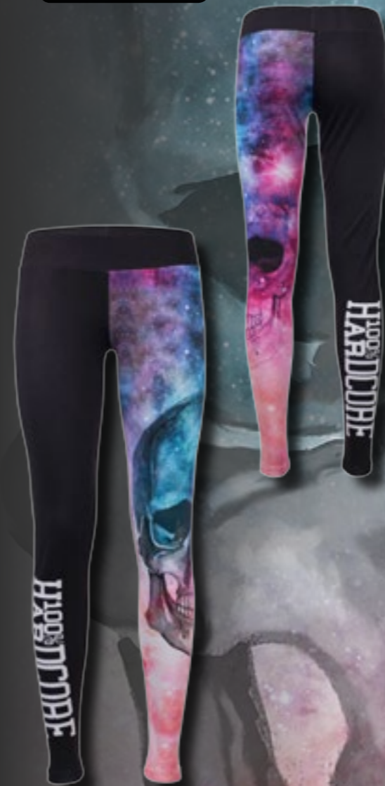
LEGGING ART.NR.: 353-L01-DREAM SIZE: XS-S-M-L-XL-XXL