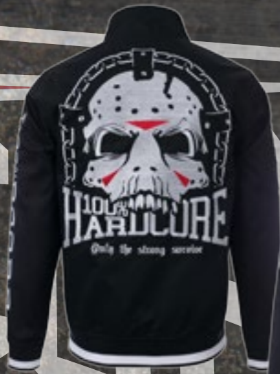
HARRINGTON JACKET ART.NR.: 315-353-050 SIZE: S-M-L-XL-XXL-XXXL