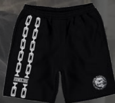
SHORT ART.NR.: 315-059-050 SIZE: S-M-L-XL-XXL