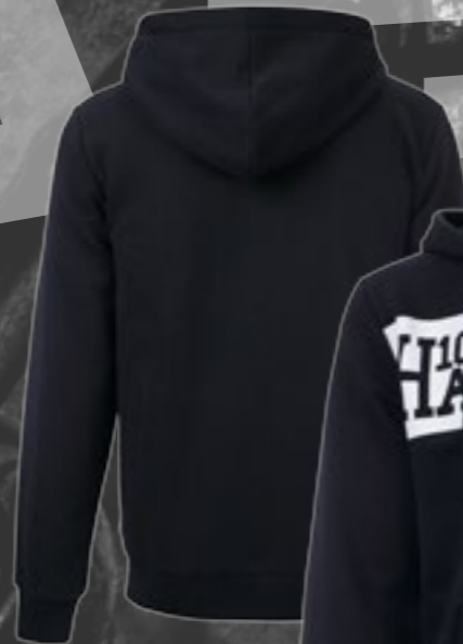
HOODED ZIPPER ART.NR.: 301-B03-050 SIZE: S-M-L-XL-XXL-XXXL