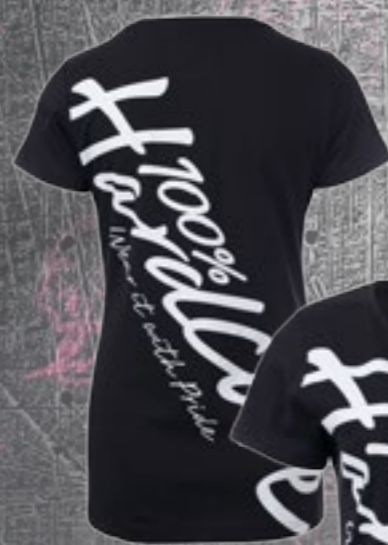
T-SHIRT ART.NR.: 355-B04-050 SIZE: XS-S-M-L-XL-XXL