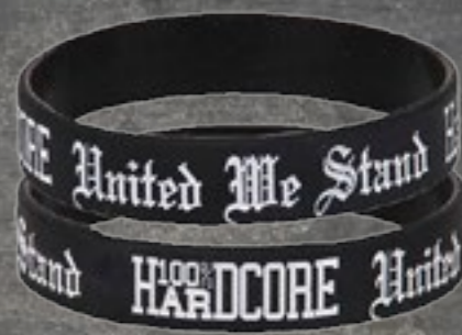
WRISTBAND ART.NR.: HC-WB01-050 SIZE: ONE SIZE