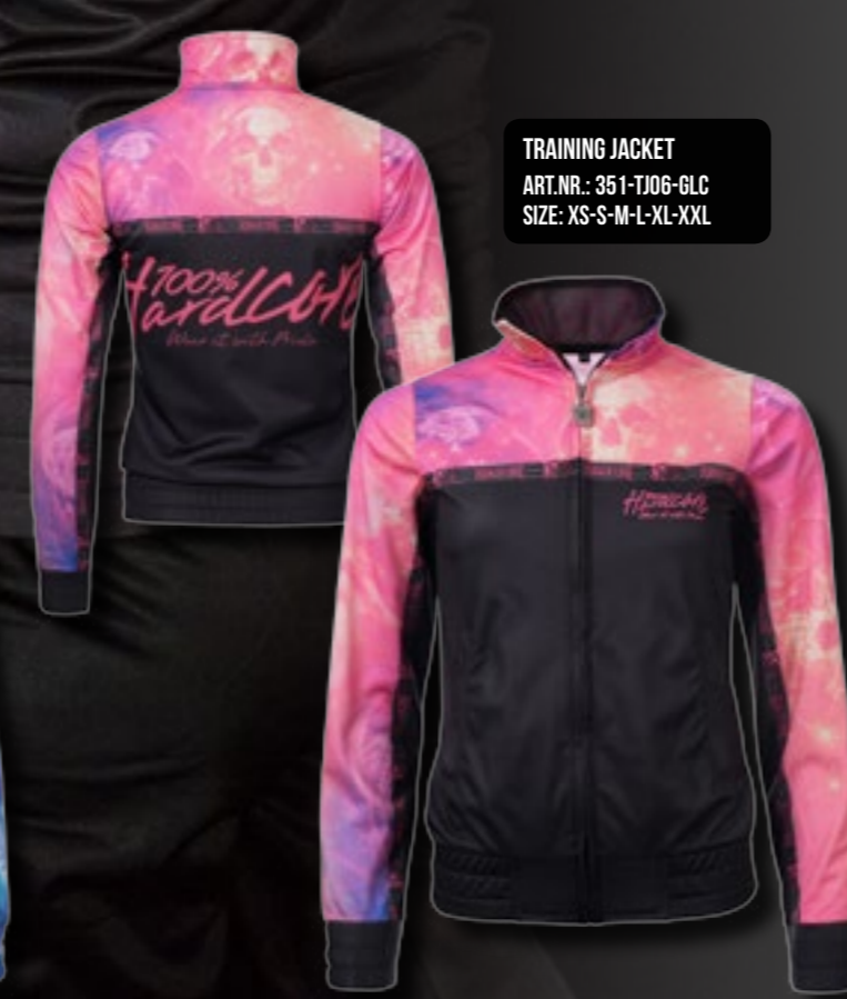
TRAINING JACKET ART.NR.: 351-TJ06-GLC SIZE: XS-S-M-L-XL-XXL