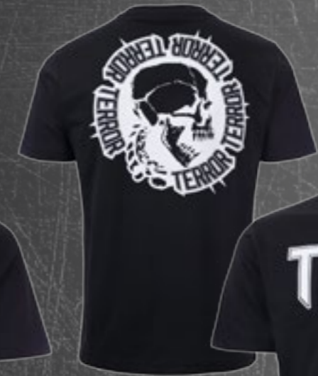
T-SHIRT ART.NR.: 805-053-050 SIZE: S-M-L-XL-XXL-XXXL