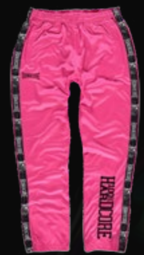
TRAINING PANTS ART.NR.: 315-001-160 SIZE: XXS-XS-S-M-L-XL