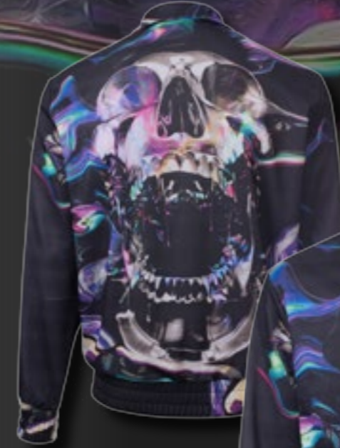
TRAINING JACKET UNISEX ART.NR.: 314-116-LT SIZE: XXS - TILL - XXXL