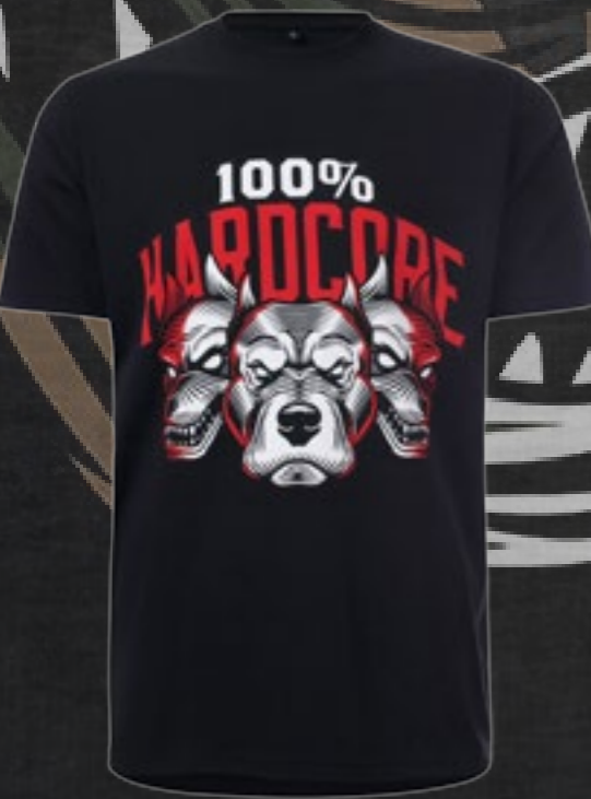
T-SHIRT ART.NR.: 305-278-050 SIZE: S-M-L-XL-XXL-XXXL