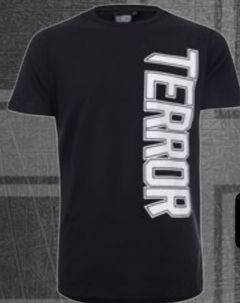
T-SHIRT ART.NR.: 805-B02-050 SIZE: S-M-L-XL