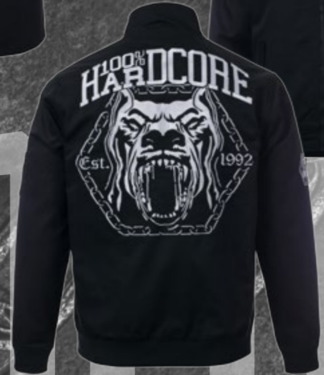
HARRINGTON JACKET ART.NR.: 315-345-050 SIZE: S-M-L-XL-XXL-XXXL