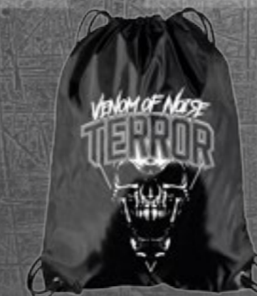
STRINGBAG ART.NR.: 875-SB03-050 SIZE: ONE SIZE