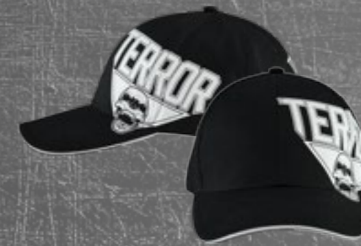
CAP ART.NR.: 830-C17-050 SIZE: ONE SIZE