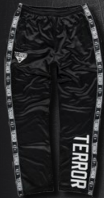
TRAINING PANTS ART.NR.: 815-TP03-050 SIZE: XS-S-M-L-XL-XXL