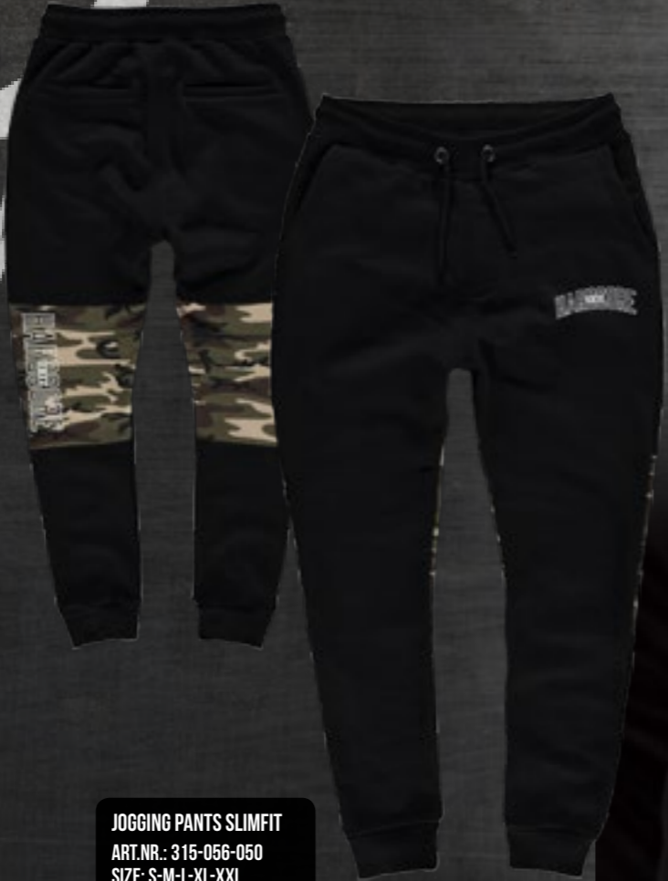
JOGGING PANTS SLIMFIT ART.NR.: 315-056-050 SIZE: S-M-L-XL-XXL