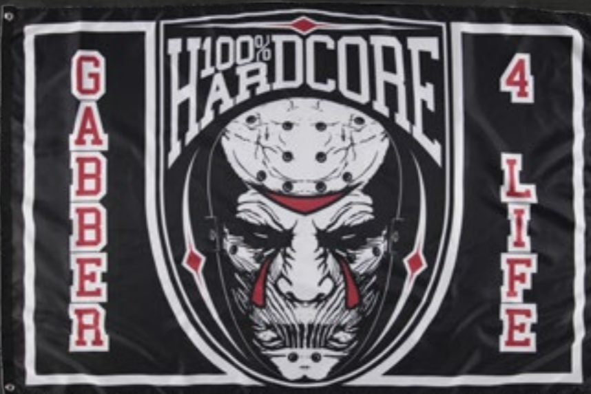
BANNER ART.NR.: 360-039-050 SIZE: 150 CM X 100 CM