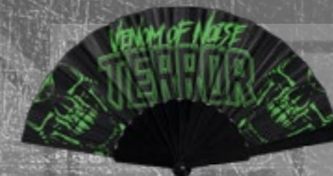
FAN ART.NR.: 840-W7-400 SIZE: ONE SIZE