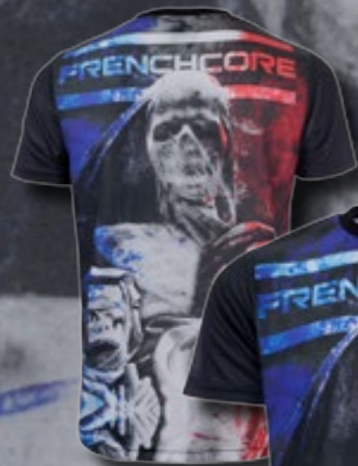
T-SHIRT ART.NR.: 905-064-050 SIZE: S-M-L-XL-XXL-XXXL