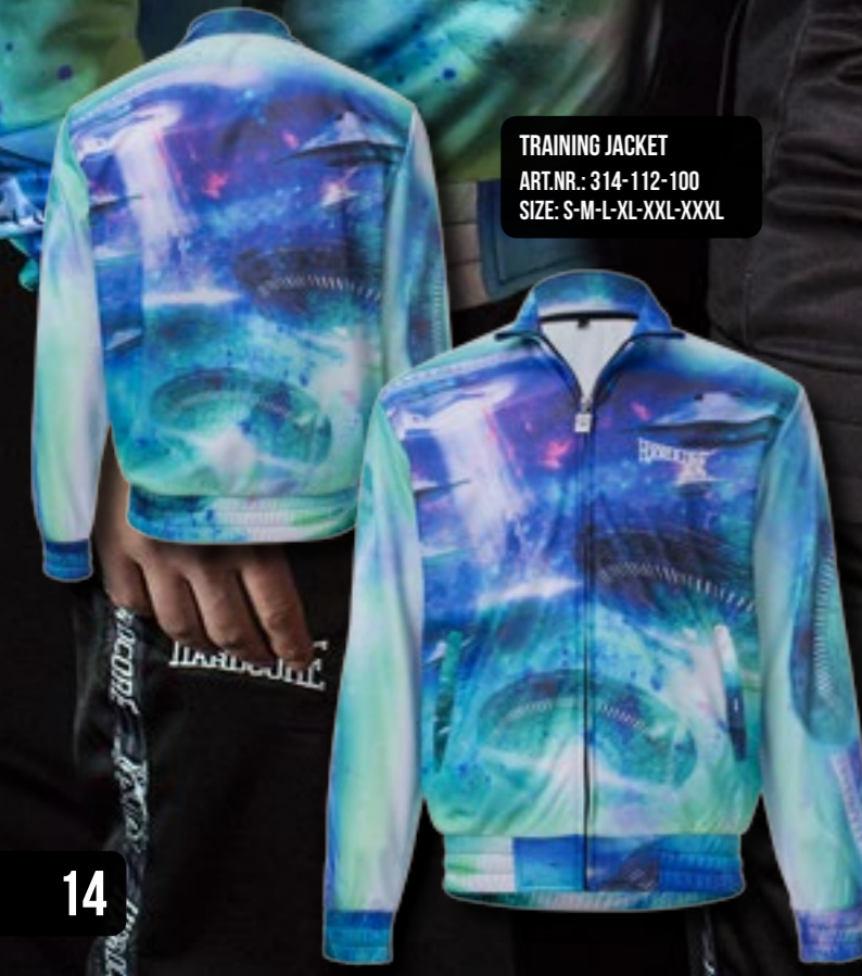
TRAINING JACKET ART.NR.: 314-112-100 SIZE: S-M-L-XL-XXL-XXXL