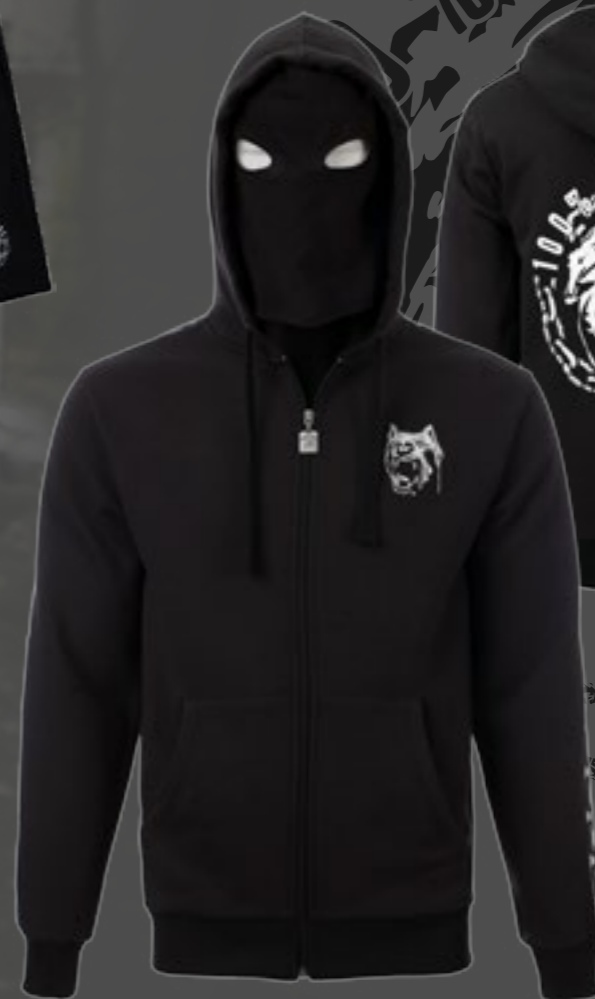
HOODED ZIP MASK ART.NR.: 301-147-050 SIZE: S-M-L-XL-XXL-XXXL