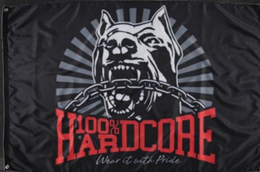
BANNER ART.NR.: 360-025-050 SIZE: 150 CM X 100 CM