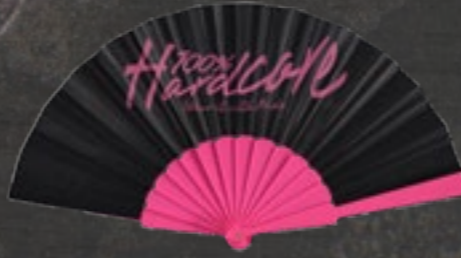
FAN ART.NR.: 340-W38-050 SIZE: ONE SIZE