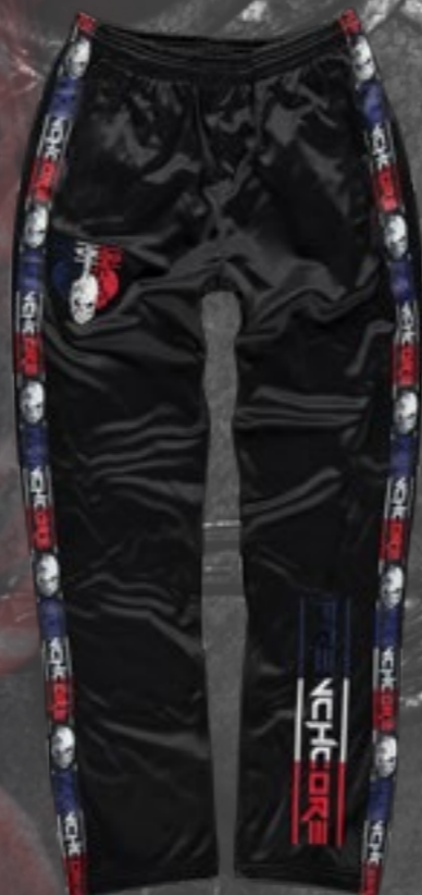
TRAINING PANTS ART.NR.: 915-TP03-050 SIZE: XS-S-M-L-XL-XXL