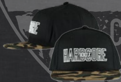
CAP SNAPBACK ART.NR.: 330-C121-050 SIZE: ONE SIZE