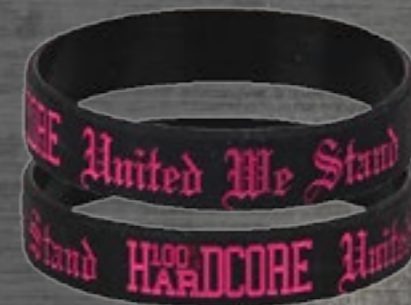
WRISTBAND ART.NR.: HC-WB01-160 SIZE: ONE SIZE