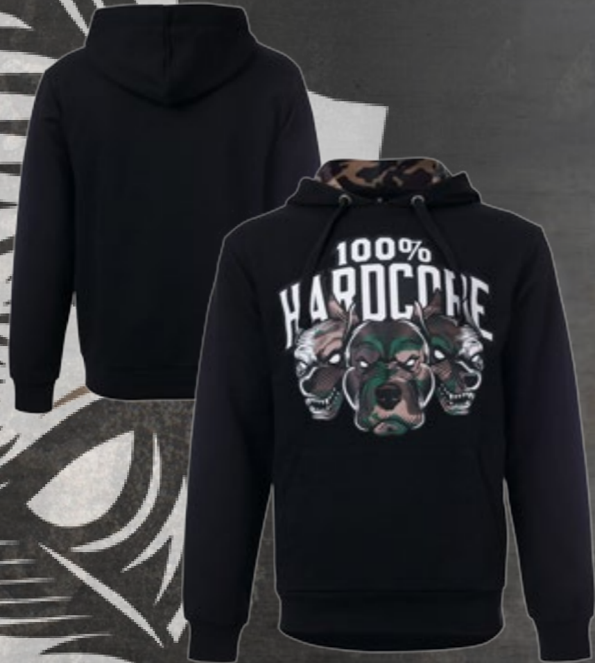
HOODED SWEATER ART.NR.: 301-149-050 SIZE: S-M-L-XL-XXL-XXXL