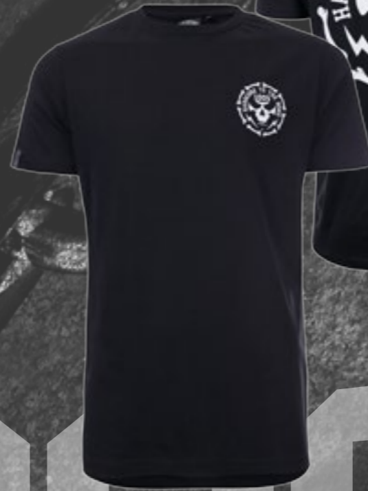
T-SHIRT ART.NR.: 305-256-050 SIZE: S-M-L-XL-XXL-XXXL