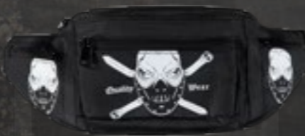
HIPBAG ART.NR.: 340-040-050 SIZE: ONE SIZE