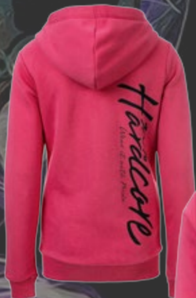
HOODED ZIPPER ART.NR.: 351-B02-160 SIZE: S-M-L-XL