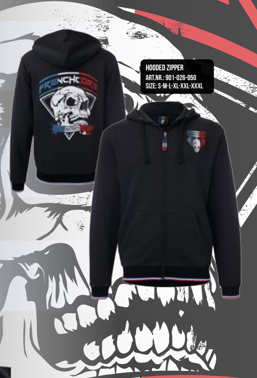
HOODED ZIPPER ART.NR.: 901-026-050 SIZE: S-M-L-XL-XXL-XXXL