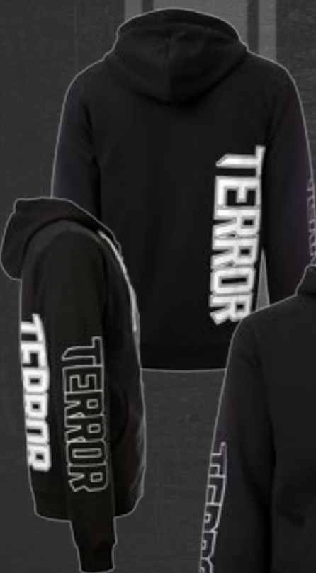
HOODED ZIPPER ART.NR.: 801-B02-050 SIZE: M-L-XL-XXL-XXXL