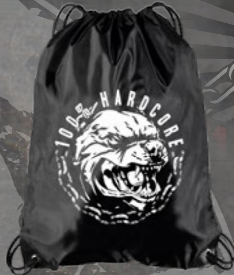
STRINGBAG ART.NR.: 375-SB04-050 SIZE: ONE SIZE