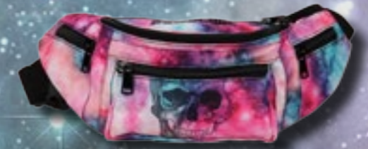
HIPBAG ART.NR.: 340-033-DREAM SIZE: ONE SIZE