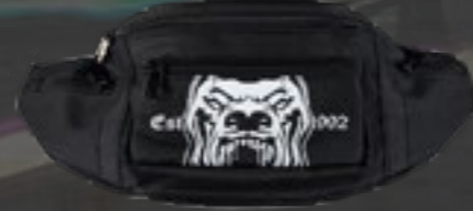
HIPBAG ART.NR.: 340-036-050 SIZE: ONE SIZE