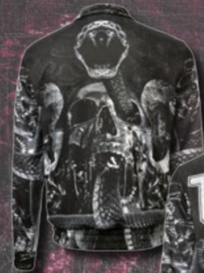
TRAINING JACKET ART.NR.: 814-009-050 SIZE: S-M-L-XL-XXL