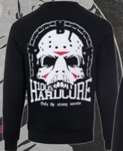
CREWNECK ART.NR.: 302-101-050 SIZE: S-M-L-XL-XXL-XXXL