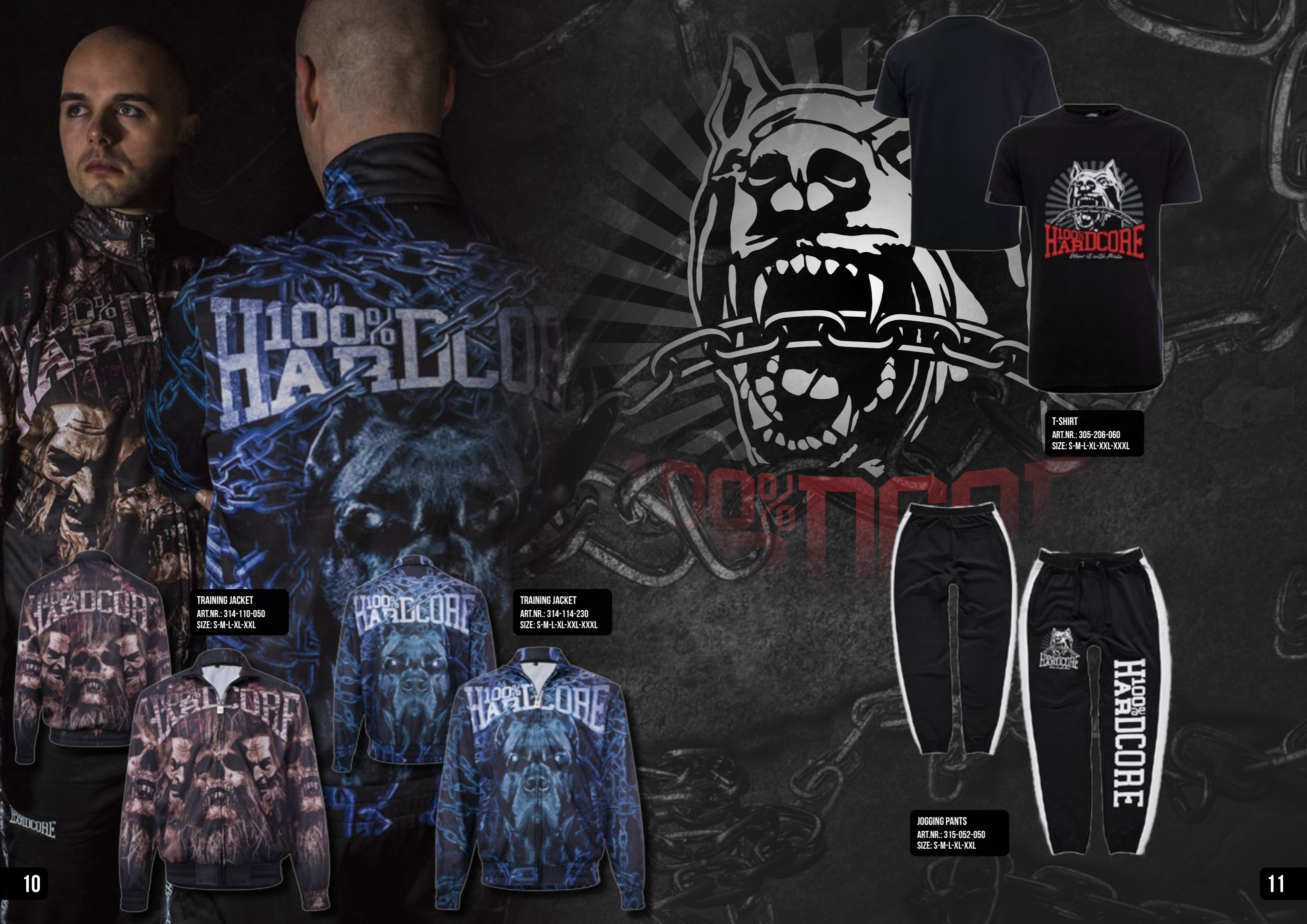
TRAINING JACKET ART.NR.: 314-110-050 SIZE: S-M-L-XL-XXL