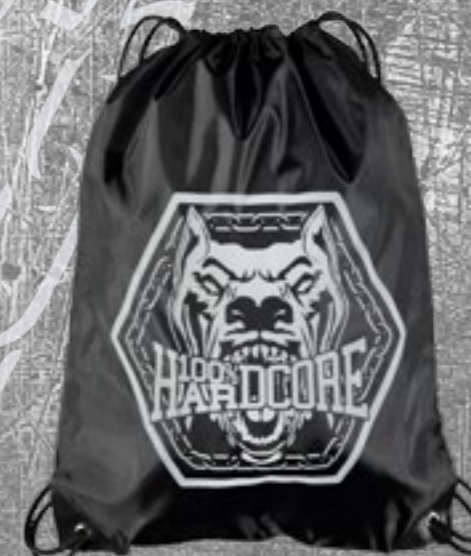
STRINGBAG ART.NR.: 375-SB1-050 SIZE: ONE SIZE