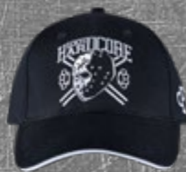
CAP ART.NR.: 330-C109-050 SIZE: ONE SIZE