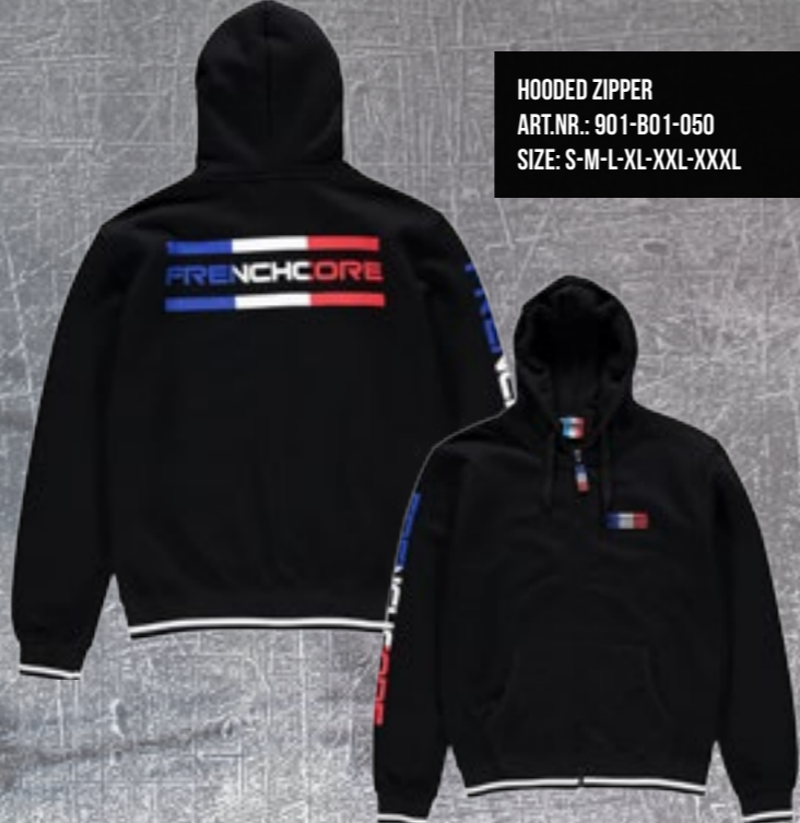
HOODED ZIPPER ART.NR.: 901-801-050 SIZE: S-M-L-XL-XXL-XXXL