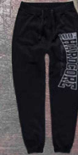
JOGGING PANTS ART.NR.: 315-014-050 SIZE: S-M-L-XL-XXL