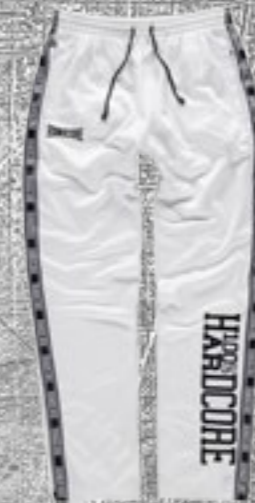
TRAINING PANTS ART.NR.: 315-001-100 SIZE: XS-S-M-L-XL-XXL-XXXL