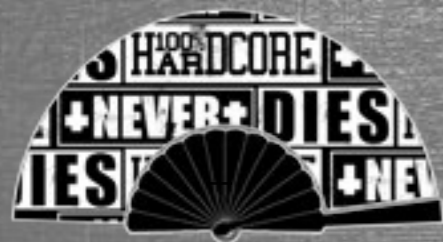
ART. NR.: 340-W25-050