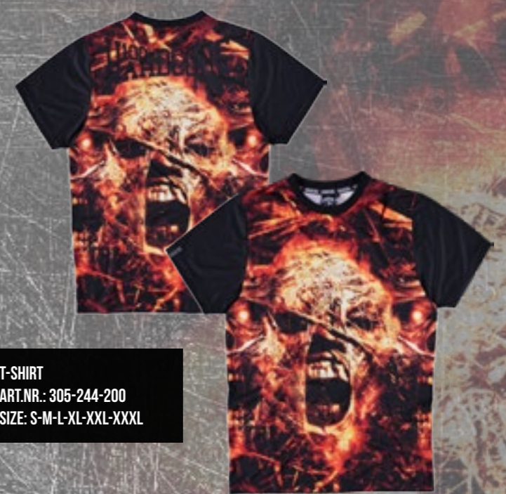
T-SHIRT ART.NR.: 305-244-200 SIZE: S-M-L-XL-XXL-XXXL