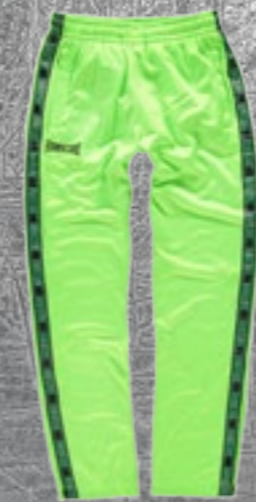
TRAINING PANTS ART.NR.: 315-010-400 SIZE: XS-S-M-L