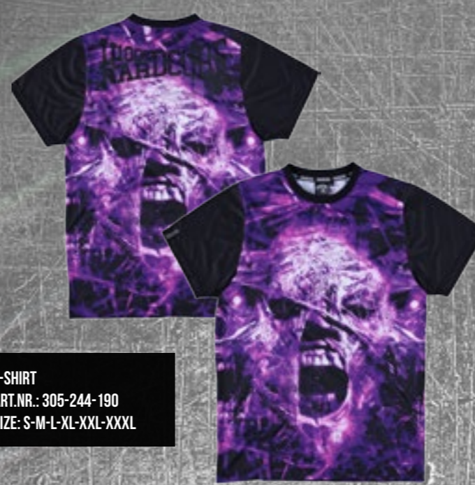
T-SHIRT ART.NR.: 305-244-190 SIZE: S-M-L-XL-XXL-XXXL