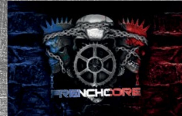
ART.NR.: 960-009-050 SIZE: 150 CM X 100 CM