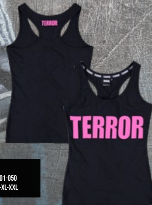
SINGLET ART.NR.: 855-B01-050 SIZE: XS-S-M-L-XL-XXL