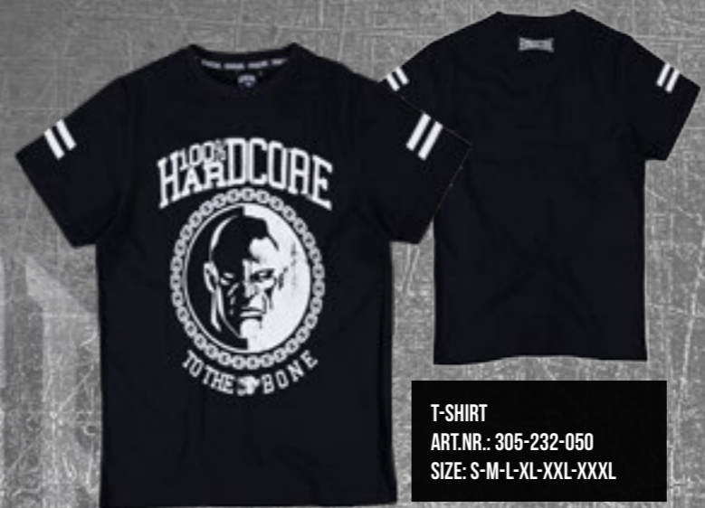
T-SHIRT ART.NR.: 305-232-050 SIZE: S-M-L-XL-XXL-XXXL