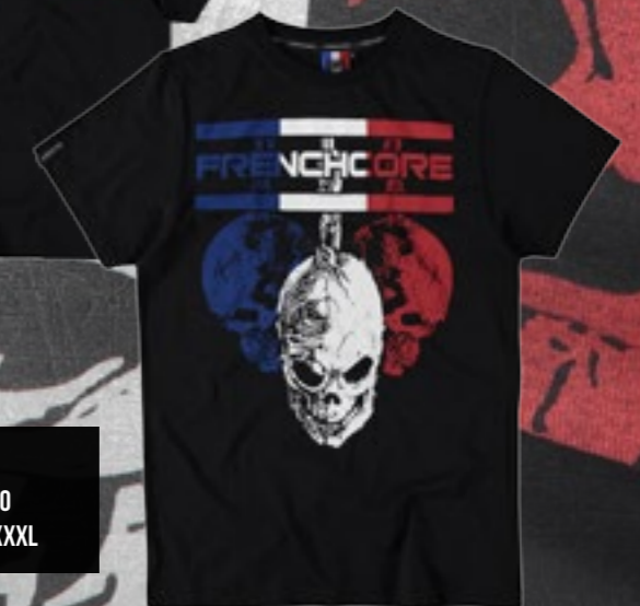
T-SHIRT ART.NR.: 905-052-050 SIZE: S-M-L-XL-XXL-XXXL