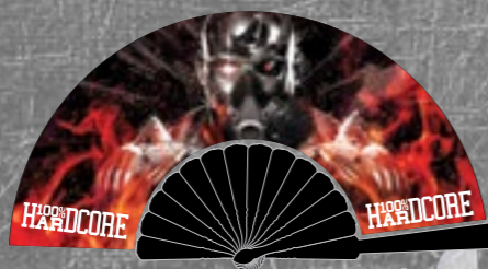
ART. NR.: 340-W22-030