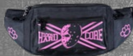
HIPBAG ART.NR.: 340-046-160 SIZE: ONE SIZE