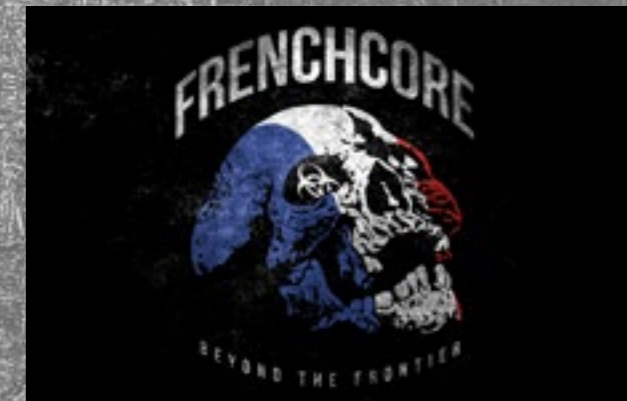
ART.NR.: 960-008-050 SIZE: 150 CM X 100 CM