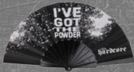
ART. NR.: 340-W3-050