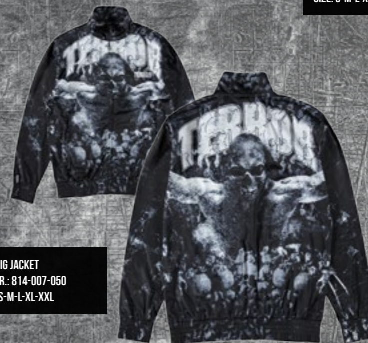
TRAINING JACKET ART.NR.: 814-007-050 SIZE: S-M-L-XL-XXL