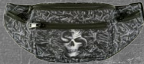
HIPBAG ART.NR.: 840-016-050 SIZE: ONE SIZE