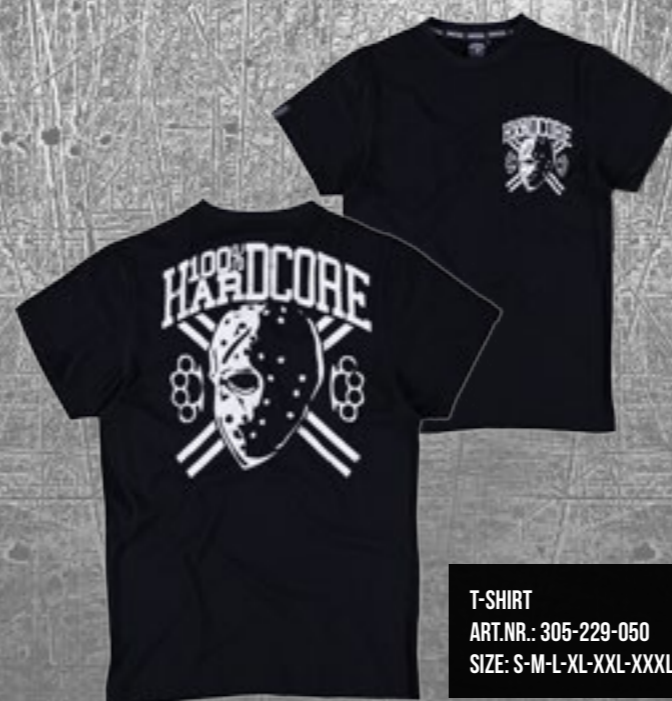
T-SHIRT ART.NR.: 305-229-050 SIZE: S-M-L-XL-XXL-XXXL