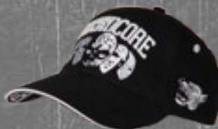
CAP ART.NR.: 330-C99-050 SIZE: ONE SIZE