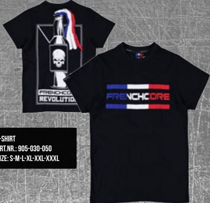
T-SHIRT ART.NR.: 905-030-050 SIZE: S-M-L-XL-XXL-XXXL