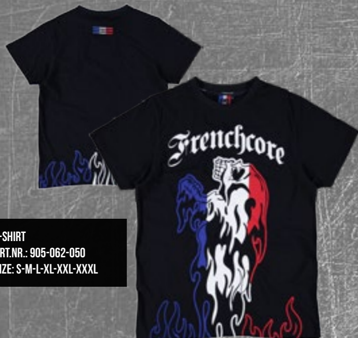
T-SHIRT ART.NR.: 905-062-050 SIZE: S-M-L-XL-XXL-XXXL