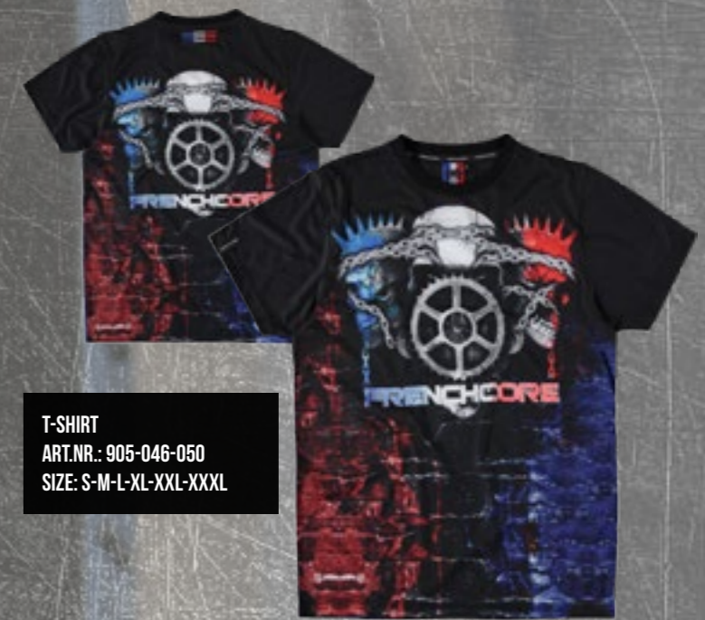
T-SHIRT ART.NR.: 905-046-050 SIZE: S-M-L-XL-XXL-XXXL