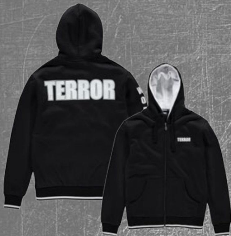
HOODED ZIPPER ART.NR.: 801-801-050 SIZE: S-M-L-XL-XXL-XXXL