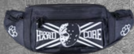
HIPBAG ART.NR.: 340-046-050 SIZE: ONE SIZE