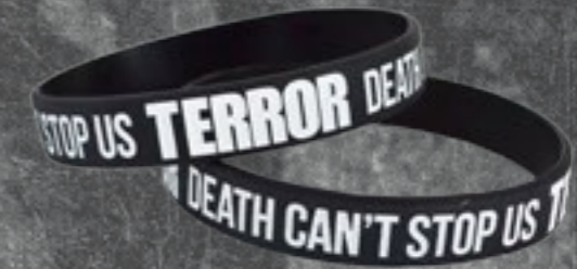
WRISTBAND ART.NR.: TE-WB01-050 SIZE: ONE SIZE