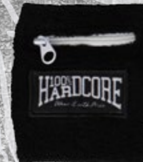
WRISTBAND 2-PACK ART.NR.: 350-006-050 SIZE: ONE SIZE