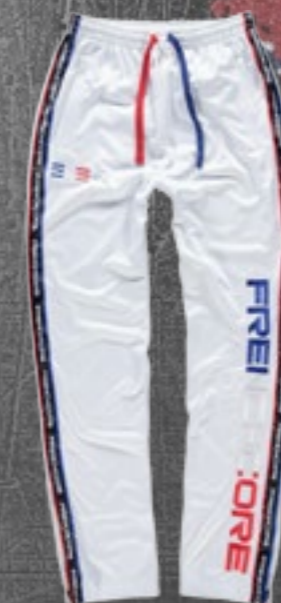
TRAINING PANTS ART.NR.: 915-TP01-100 SIZE: XS-S-M-L