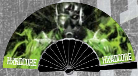
ART. NR.: 340-W22-400