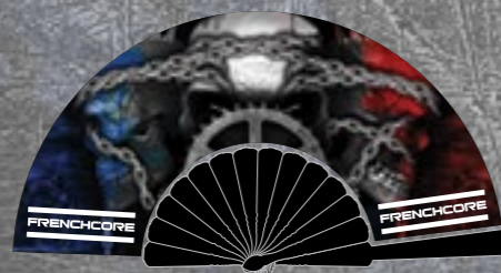
FAN ART.NR.: 940-W5-050 SIZE: ONE SIZE