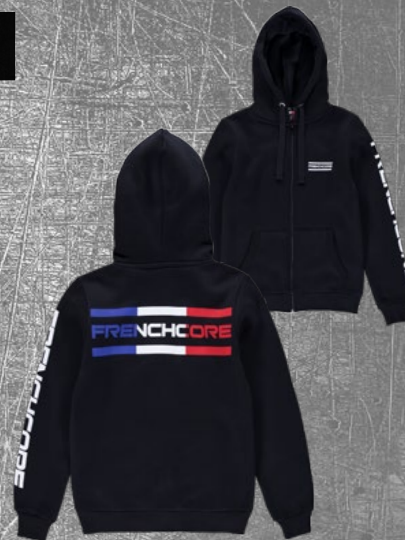
HOODED ZIPPER ART.NR.: 951-801-050 SIZE: XS-S-M-L-XL-XXL