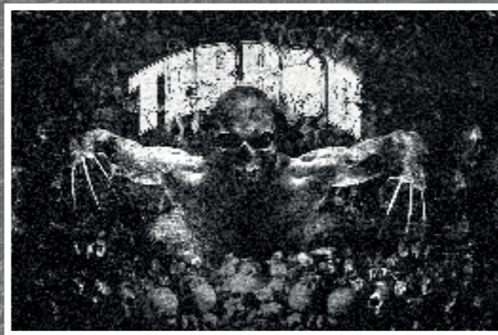
ART.NR.: 860-011-050 SIZE: 150 CM X 100 CM