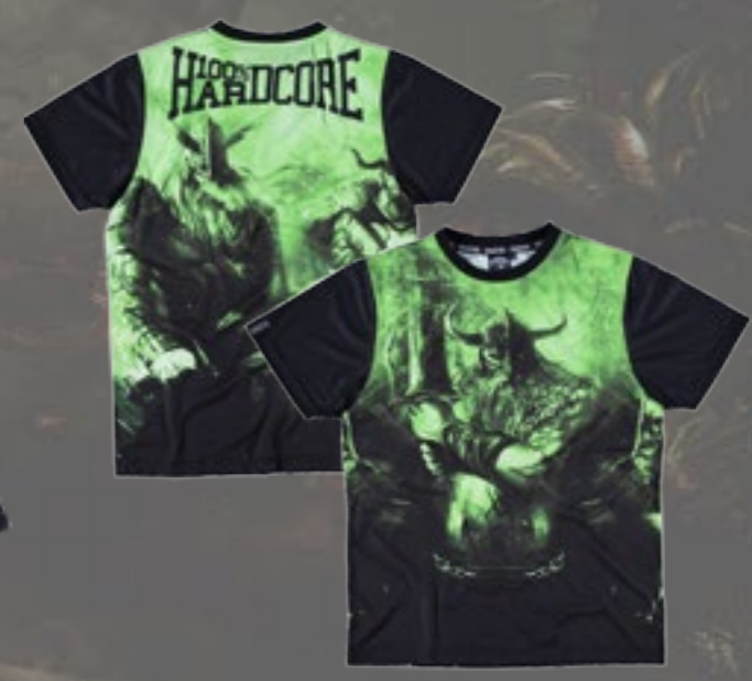
T-SHIRT ART.NR.: 305-246-400 SIZE: S-M-L-XL-XXL-XXXL