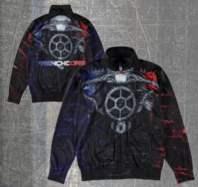
TRAINING JACKET ART.NR.: 914-006-050 SIZE: S-M-L-XL-XXL-XXXL