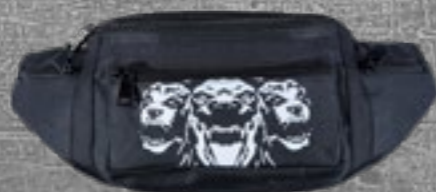
HIPBAG ART.NR.: 340-044-050 SIZE: ONE SIZE