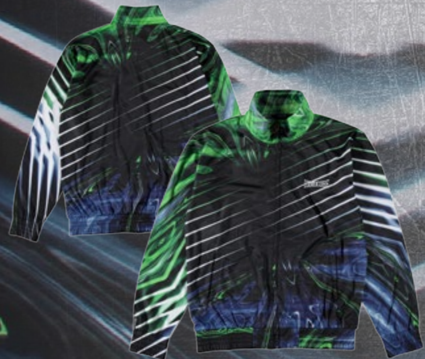
TRAINING JACKET ART.NR.: 314-095-400 SIZE: S-M-L-XL-XXL-XXXL