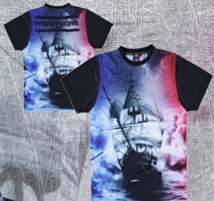
T-SHIRT ART.NR.: 905-054-050 SIZE: S-M-L-XL-XXL-XXXL