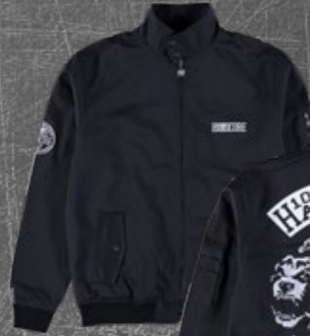
HARRINGTON JACKET ART.NR.: 315-351-050 SIZE: S-M-L-XL-XXL-XXXL