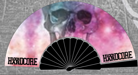
ART. NR.: 340-W20-DREAM