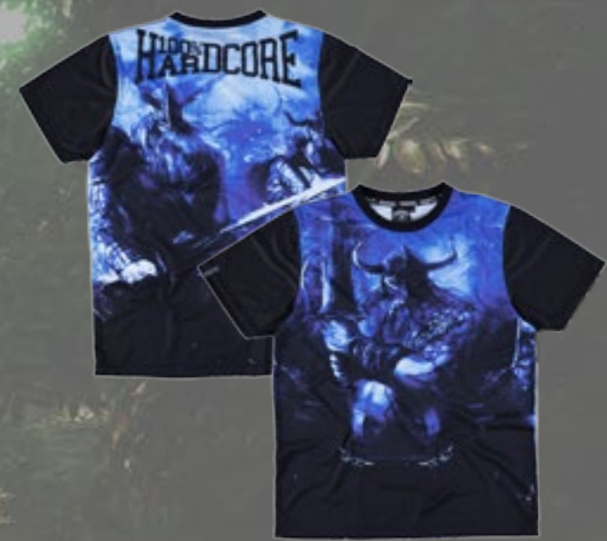
T-SHIRT ART.NR.: 305-246-230 SIZE: S-M-L-XL-XXL-XXXL