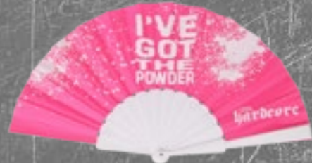
ART. NR.: 340-W3-160