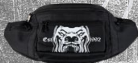
HIPBAG ART.NR.: 340-036-050 SIZE: ONE SIZE