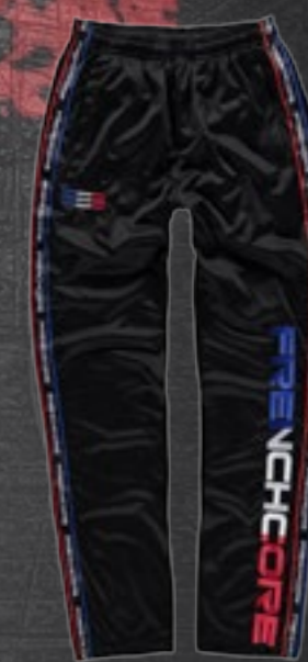
TRAINING PANTS ART.NR.: 915-TP01-050 SIZE: M-L-XL-XXL