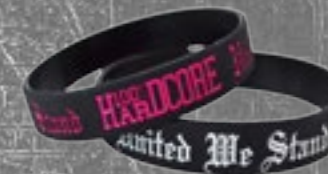
WRISTBAND ART.NR.: HC-WB01-160 / 050 SIZE: ONE SIZE