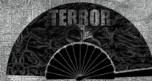
FAN ART.NR.: 840-W6-050 SIZE: ONE SIZE