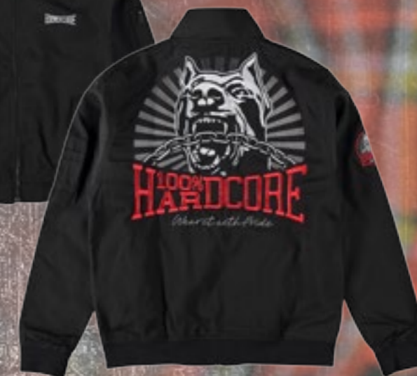
HARRINGTON JACKET ART.NR.: 315-146-050 SIZE: S-M-L-XL