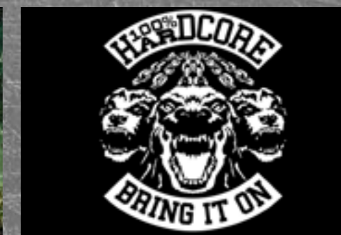
ART.NR.: 360-029-050 SIZE: 150 CM X 100 CM