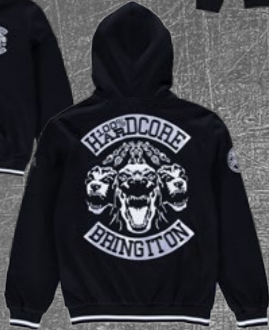
HOODED ZIPPER ART.NR.: 301-133-050 SIZE: S-M-L-XL-XXL-XXXL