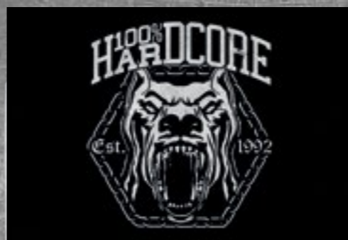
ART.NR.: 360-026-050 SIZE: 150 CM X 100 CM