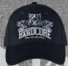
CAP ART.NR.: 330-C110-050 SIZE: ONE SIZE