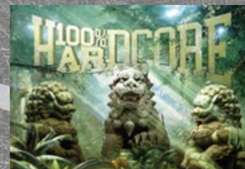
ART.NR.: 360-031-050 SIZE: 150 CM X 100 CM