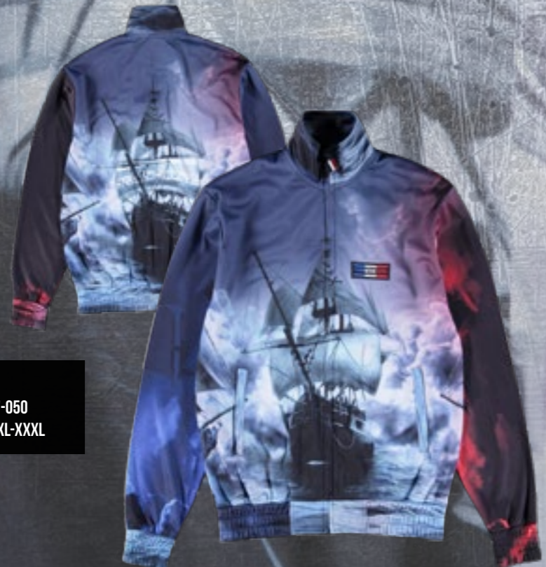
TRAINING JACKET ART.NR.: 914-007-050 SIZE: S-M-L-XL-XXL-XXXL