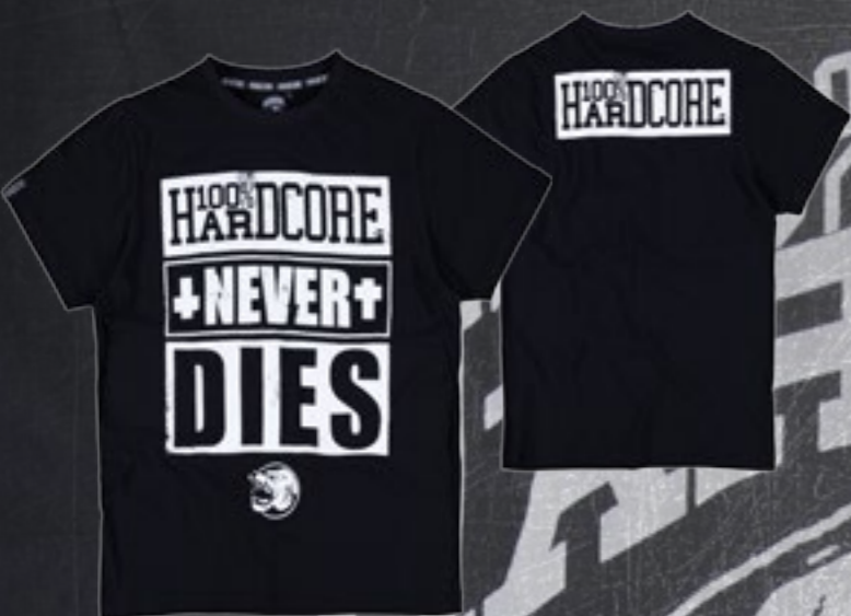
T-SHIRT ART.NR.: 305-238-050 SIZE: S-M-L-XL-XXL-XXXL