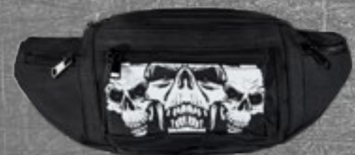
HIPBAG ART.NR.: 840-012-050 SIZE: ONE SIZE