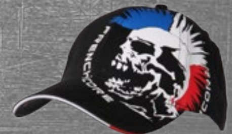
HIPBAG ART.NR.: 930-C10-050 SIZE: ONE SIZE