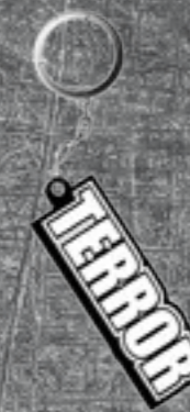
ART. NR.: 875-KC01-050