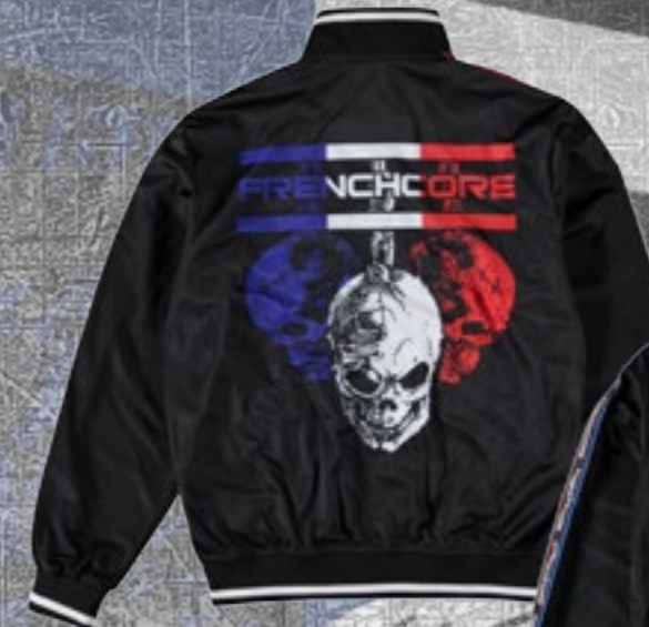
TRAINING JACKET ART.NR.: 914-TJ03-050 SIZE: S-M-L-XL-XXL-XXXL