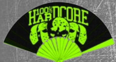
ART. NR.: 340-W17-400