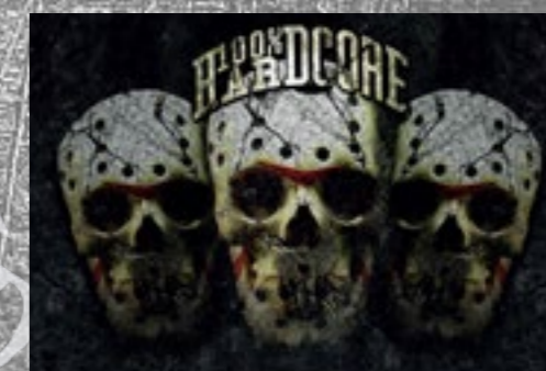
ART.NR.: 360-024-050 SIZE: 150 CM X 100 CM