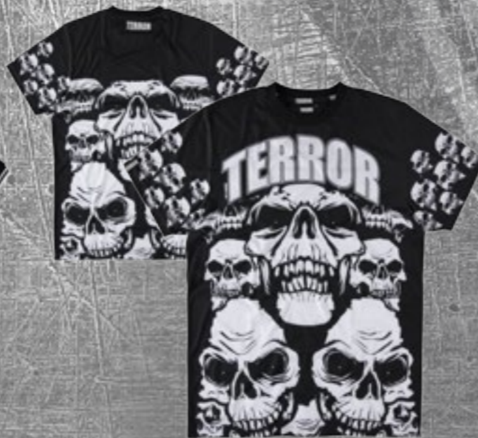
T-SHIRT ART.NR.: 805-033-050 SIZE: S-M-L-XL