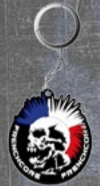
ART. NR.: 975-KC02-050