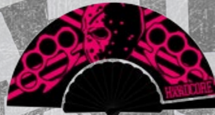
ART. NR.: 340-W27-160