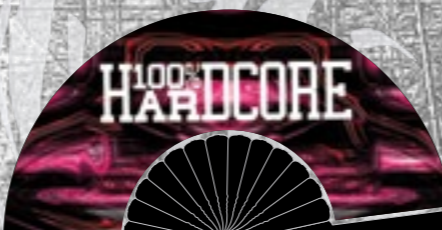
ART. NR.: 340-W21-160