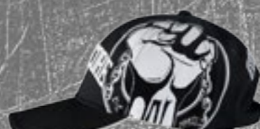
CAP ART.NR.: 330-C105-050 SIZE: ONE SIZE