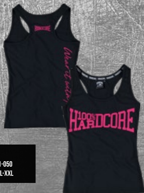
SINGLET ART.NR.: 355-B01-050 SIZE: XS-S-M-L-XL-XXL