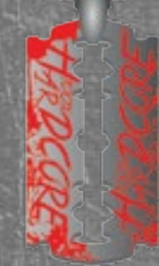
NECKLACE ART.NR.: 100HC-CHAIN-002 SIZE: ONE SIZE