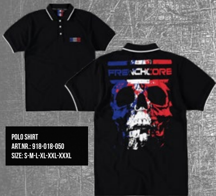
POLO SHIRT ART.NR.: 918-018-050 SIZE: S-M-L-XL-XXL-XXXL