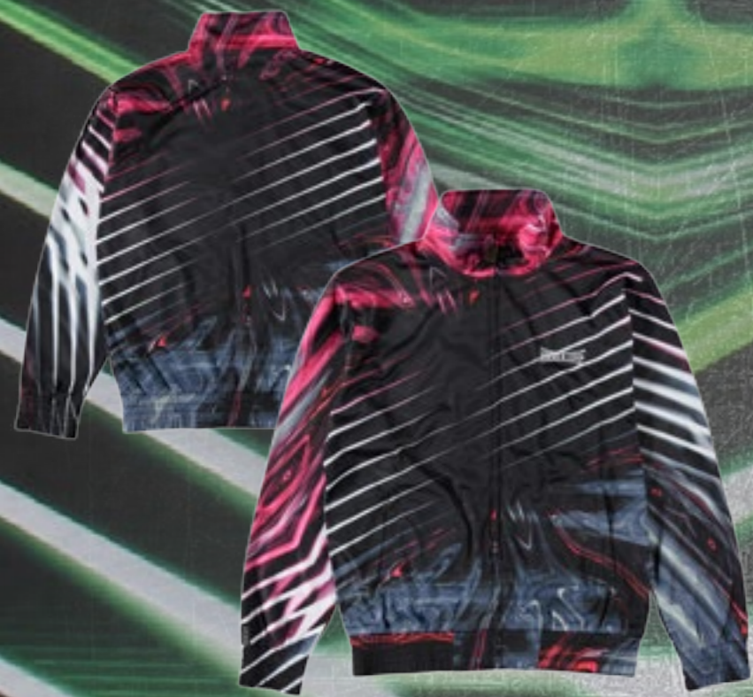
TRAINING JACKET ART.NR.: 314-095-160 SIZE: S-M-L-XL-XXL-XXXL