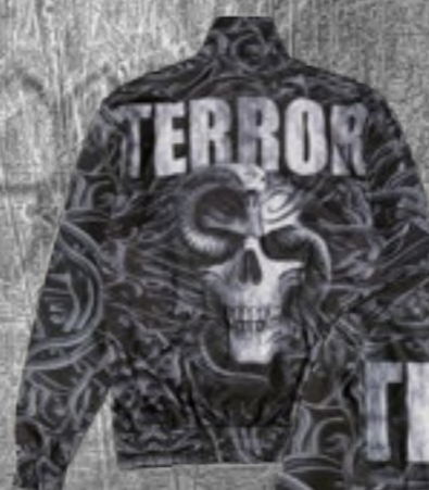
TRAINING JACKET ART.NR.: 814-010-050 SIZE: S-M-L-XL-XXL-XXXL