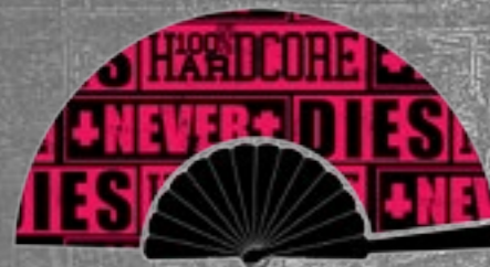
ART. NR.: 340-W25-160