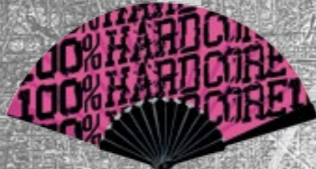
ART. NR.: 340-W16-050