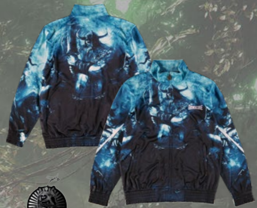
TRAINING JACKET ART.NR.: 314-099-230 SIZE: S-M-L-XL-XXL-XXXL