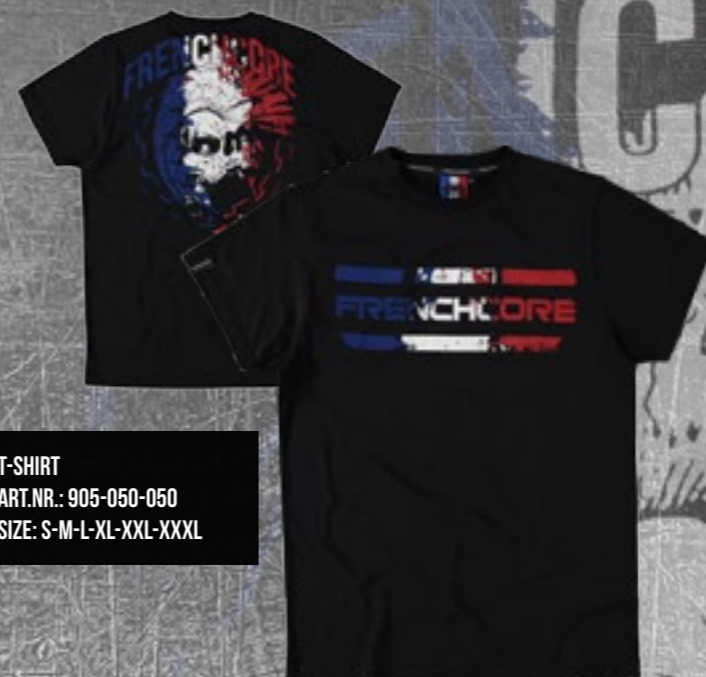
T-SHIRT ART.NR.: 905-050-050 SIZE: S-M-L-XL-XXL-XXXL