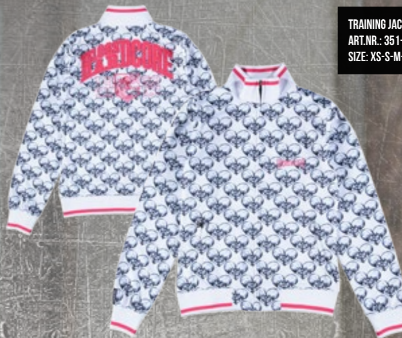
TRAINING JACKET ART.NR.: 351-TJ01-100FS SIZE: XS-S-M-L-XL-XXL