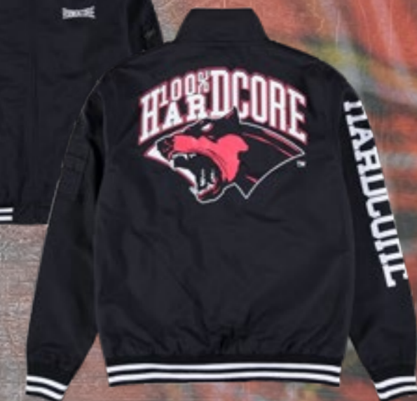
HARRINGTON JACKET ART.NR.: 315-HJ01-050 SIZE: S-M-L-XL-XXL-XXXL