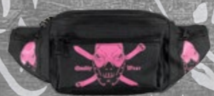
HIPBAG ART.NR.: 340-040-160 SIZE: ONE SIZE