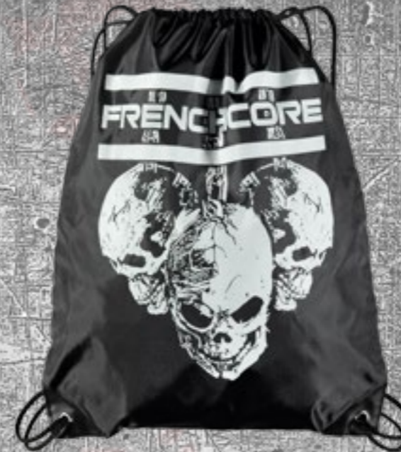
STRINGBAG ART.NR.: 975-SB1-050 SIZE: ONE SIZE