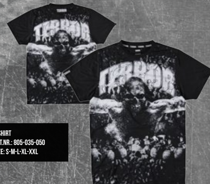
T-SHIRT ART.NR.: 805-035-050 SIZE: S-M-L-XL-XXL