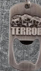
ART. NR.: TER-CHAIN01-050