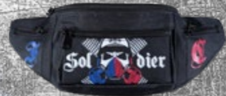
HIPBAG ART.NR.: 940-014-050 SIZE: ONE SIZE