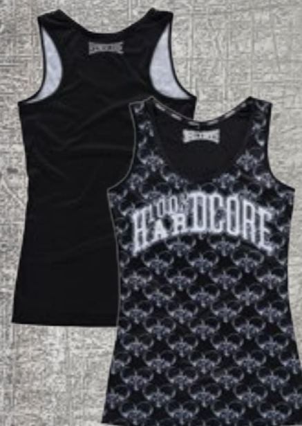
SINGLET ART.NR.: 356-001-050FS SIZE: XS-S-M-L-XL-XXL