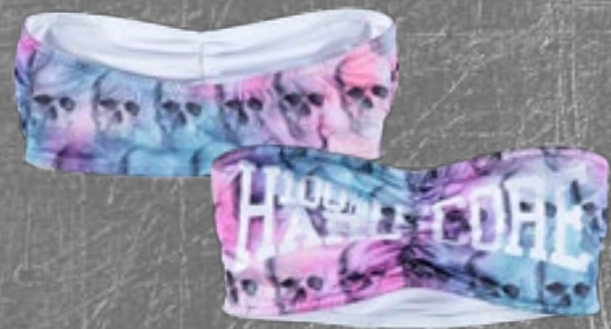
SPORT TOP ART.NR.: 355-SPORT-DREAM SIZE: XS-S-M-L-XL-XXL