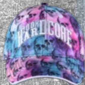
CAP ART.NR.: 330-C101-DREAM SIZE: ONE SIZE