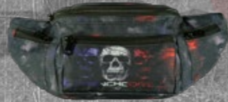
HIPBAG ART.NR.: 940-013-050 SIZE: ONE SIZE