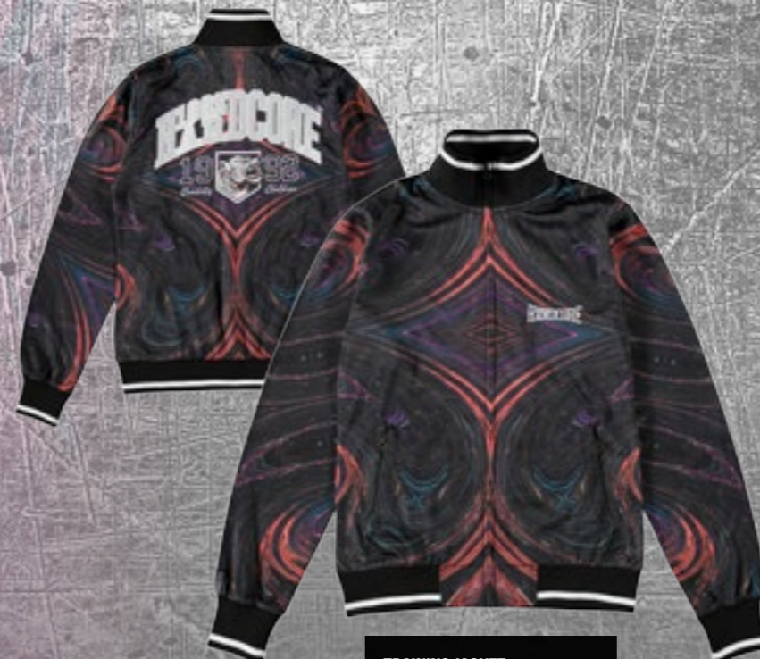
TRAINING JACKET ART.NR.: 351-TJ01-050PS SIZE: XS-S-M-L-XL