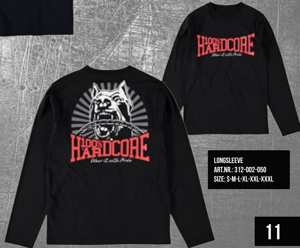
LONGSLEEVE ART.NR.: 312-002-050 SIZE: S-M-L-XL-XXL-XXXL