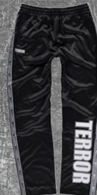
TRAINING PANTS ART.NR.: 815-TP02-050 SIZE: M-L-XL-XXL