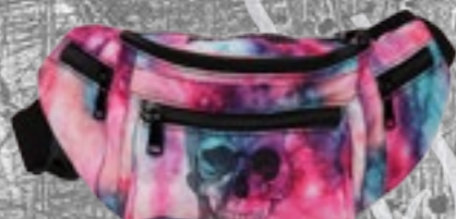
HIPBAG ART.NR.: 340-033-DREAM SIZE: ONE SIZE