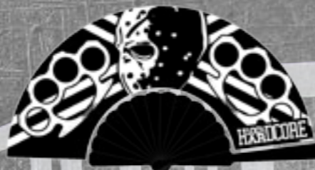
ART. NR.: 340-W27-050