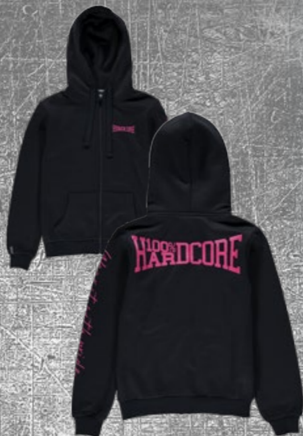
HOODED ZIPPER ART.NR.: 351-B01-050 SIZE: XS-S-M-L-XL