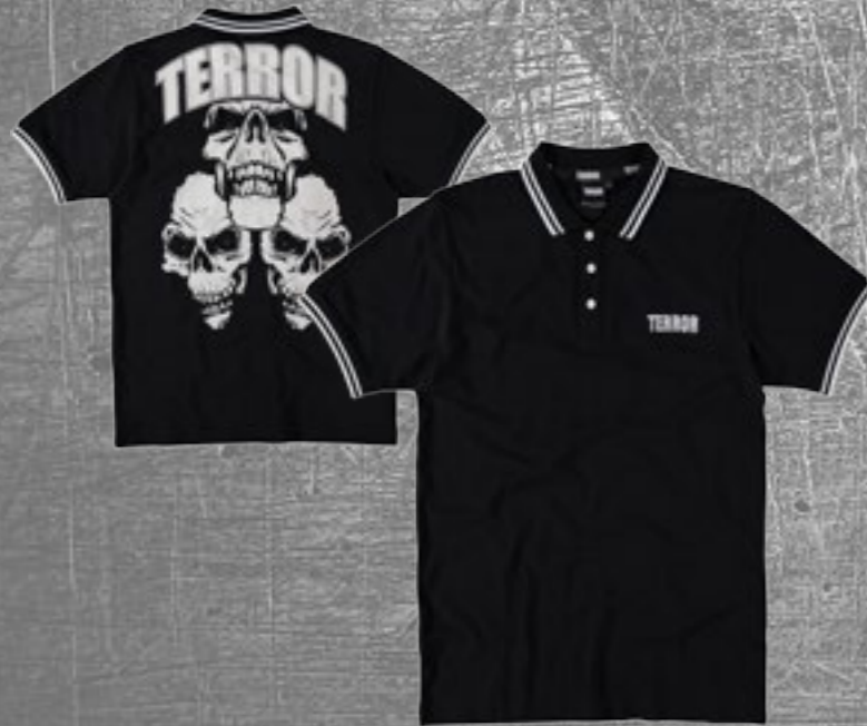
POLO SHIRT ART.NR.: 818-001-050 SIZE: S-M-L-XL-XXL-XXXL