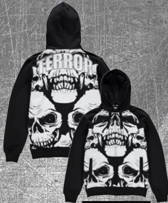
HOODED ZIPPER ART.NR.: 801-008-050 SIZE: S-M-L-XL-XXL