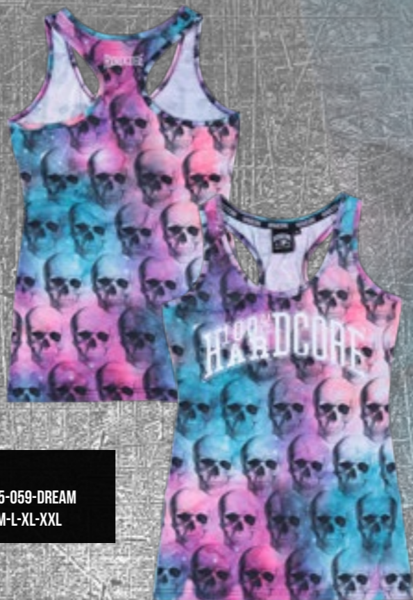
SINGLET ART.NR.: 355-059-DREAM SIZE: XS-S-M-L-XL-XXL