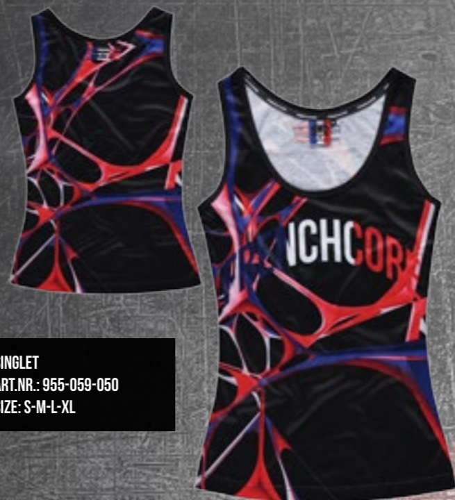
SINGLET ART.NR.: 955-059-050 SIZE: S-M-L-XL