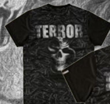
T-SHIRT ART.NR.: 805-043-050 SIZE: S-M-L-XL-XXL-XXXL