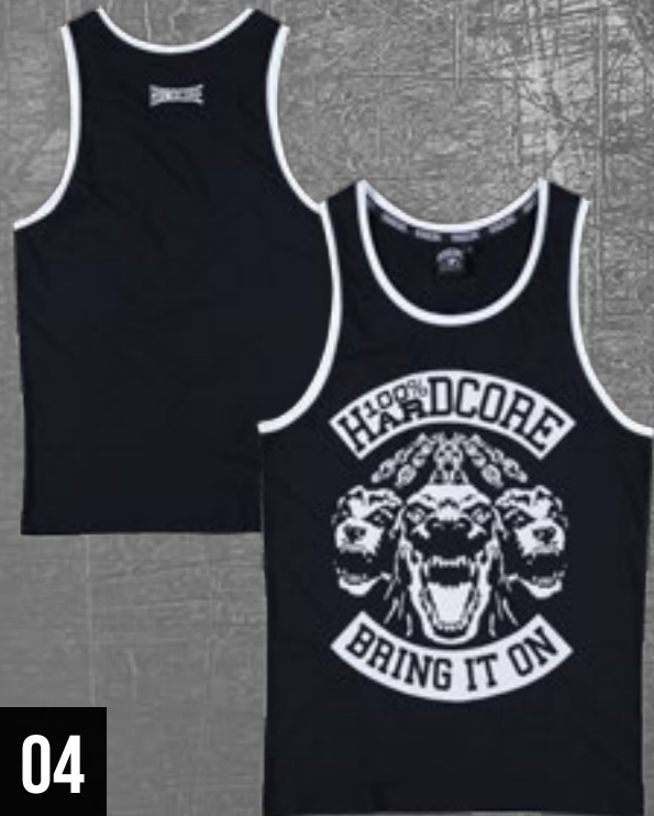
SINGLET ART.NR.: 305-252-050 SIZE: S-M-L-XL-XXL-XXXL