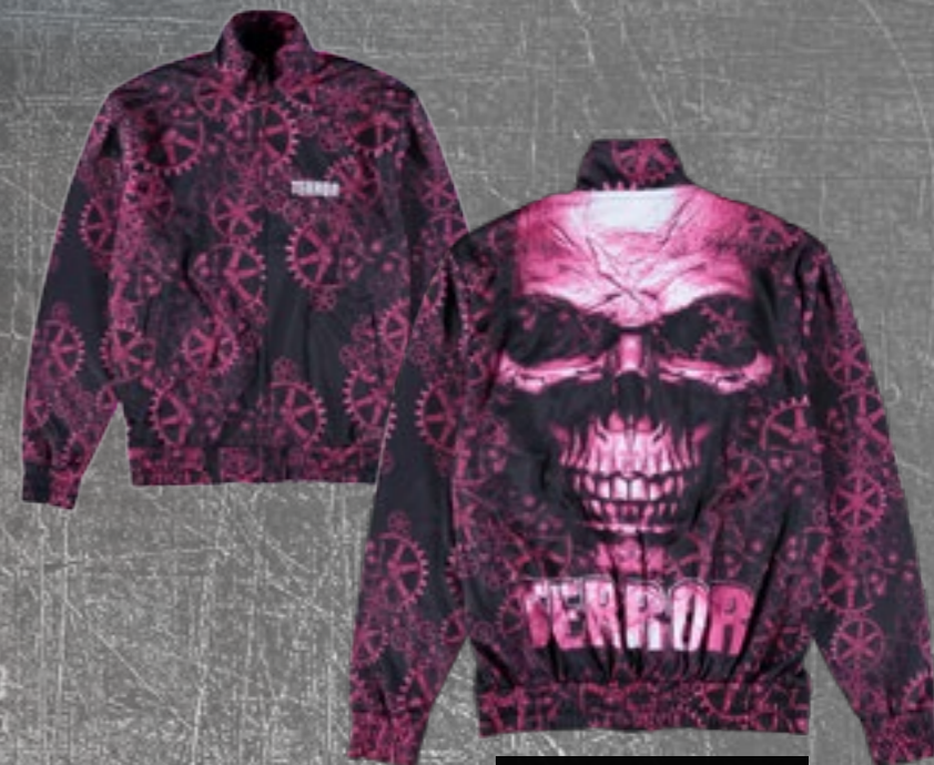
TRAINING JACKET ART.NR.: 814-003-160 SIZE: XS-S-M-L-XL-XXL