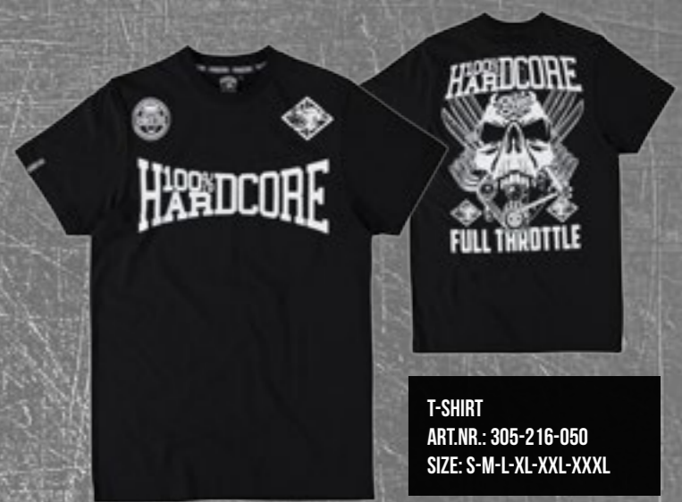
T-SHIRT ART.NR.: 305-216-050 SIZE: S-M-L-XL-XXL-XXXL