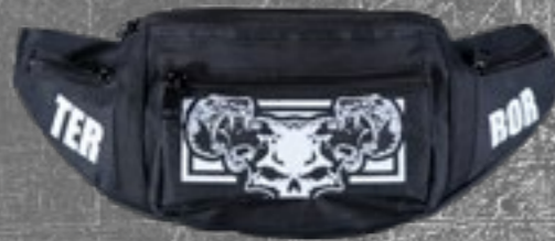
HIPBAG ART.NR.: 840-014-050 SIZE: ONE SIZE