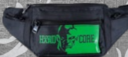
HIPBAG ART.NR.: 340-048-400 SIZE: ONE SIZE