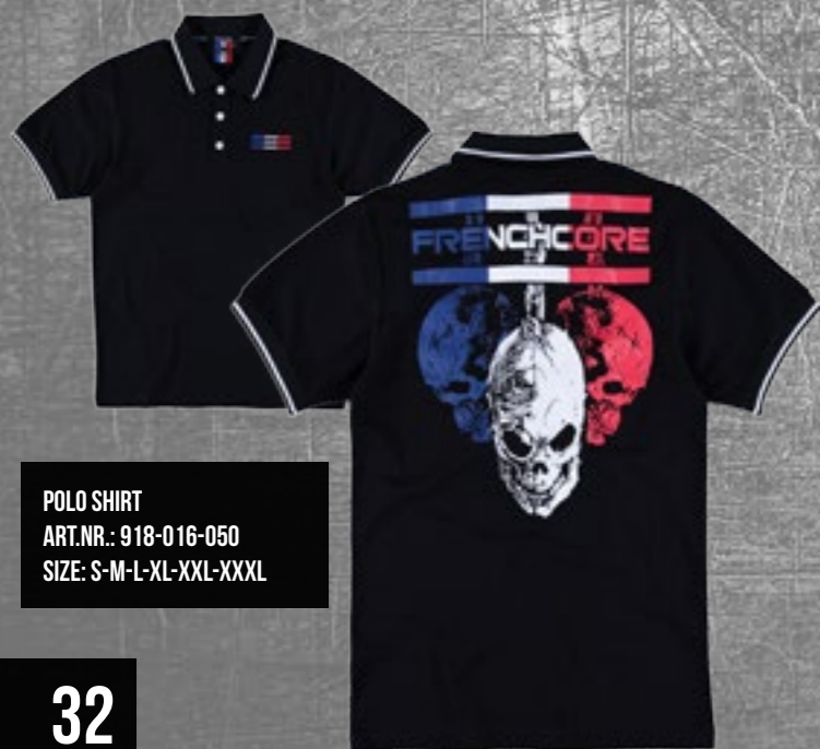
POLO SHIRT ART.NR.: 918-016-050 SIZE: S-M-L-XL-XXL-XXXL