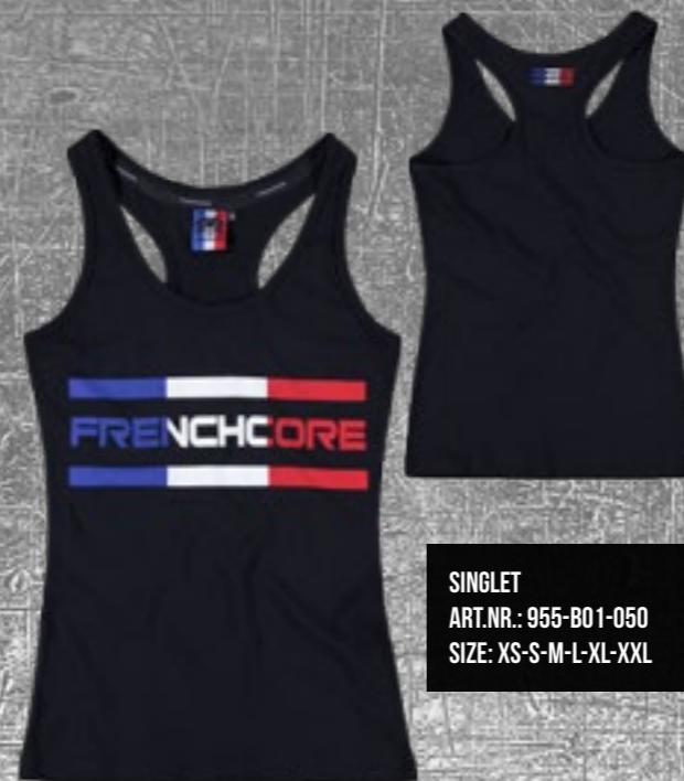
SINGLET ART.NR.: 955-801-050 SIZE: XS-S-M-L-XL-XXL