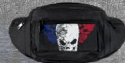
HIPBAG ART.NR.: 940-012-050 SIZE: ONE SIZE