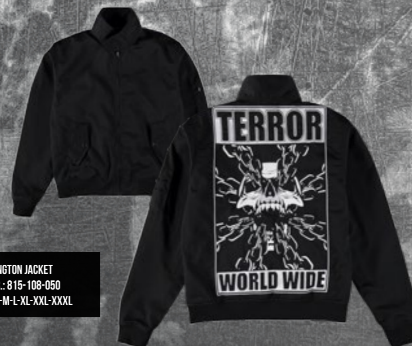
HARRINGTON JACKET ART.NR.: 815-108-050 SIZE: S-M-L-XL-XXL-XXXL