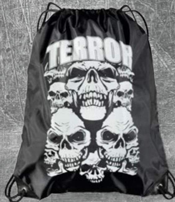
STRINGBAG ART.NR.: 875-SB1-050 SIZE: ONE SIZE