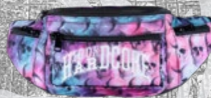
HIPBAG ART.NR.: 340-034-DREAM SIZE: ONE SIZE