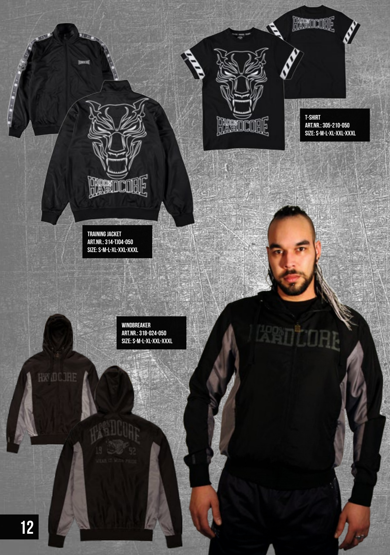
T-SHIRT ART.NR.: 305-210-050 SIZE: S-M-L-XL-XXL-XXXL

FESTIVAL INFO: HARDSHOCKFESTIVAL.COM MERCHANDISE: HARDSHOCKMERCHANDISE.COM