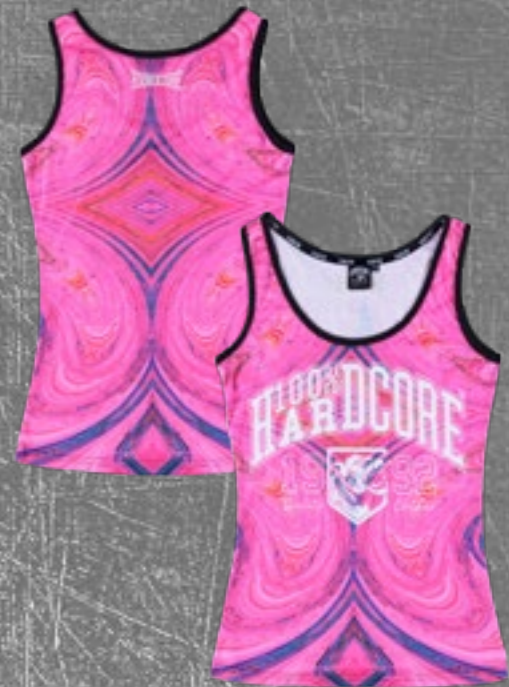
SINGLET ART.NR.: 355-058-160PS SIZE: XS-S-M-L-XL-XXL