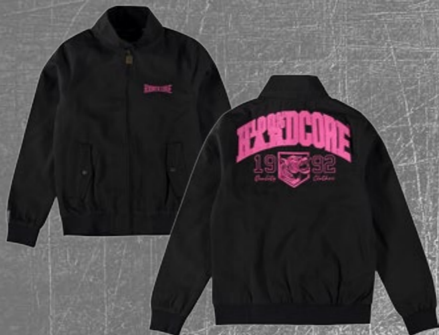
HARRINGTON JACKET ART.NR.: 358-012-050 SIZE: XS-S-M-L-XL