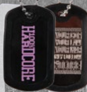
DOGTAG ART.NR.: HC-DT-160 SIZE: ONE SIZE