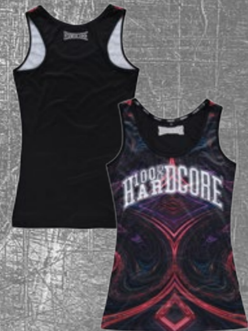
SINGLET ART.NR.: 356-058-050PS SIZE: XS-S-M-L-XL