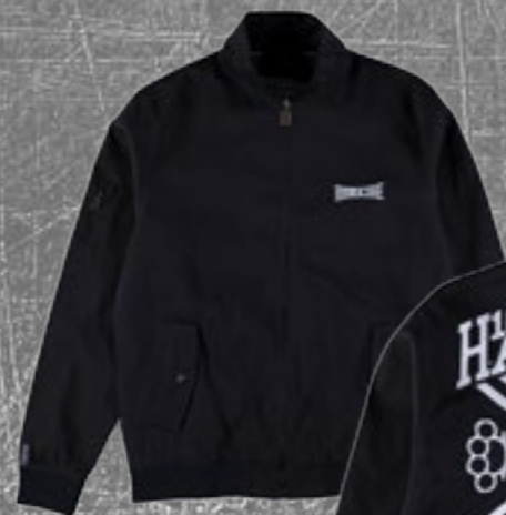
HARRINGTON JACKET ART.NR.: 315-347-050 SIZE: S-M-L-XL-XXL-XXXL