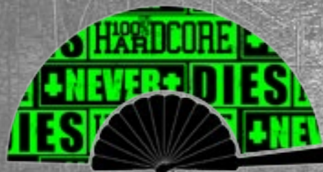
ART. NR.: 340-W25-400