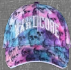
CAP ART.NR.: 330-C101-DREAM SIZE: ONE SIZE