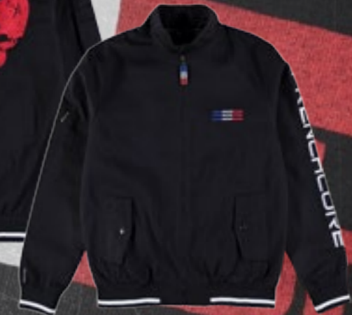
HARRINGTON JACKET ART.NR.: 915-120-050 SIZE: S-M-L-XL-XXL-XXXL