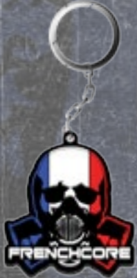
ART. NR.: 975-KC03-050