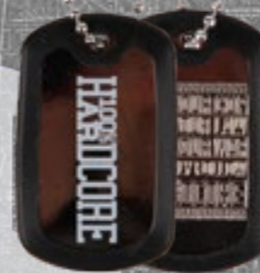
DOGTAG ART.NR.: HC-DT-050 SIZE: ONE SIZE