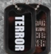
ART. NR.: TE-DT-001