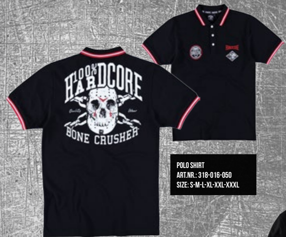
POLO SHIRT ART.NR.: 318-016-050 SIZE: S-M-L-XL-XXL-XXXL