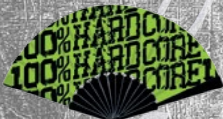
ART. NR.: 340-W16-400