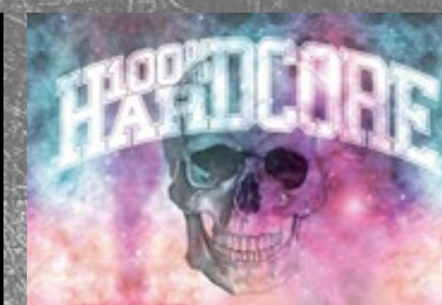
ART.NR.: 360-027-DREAM SIZE: 150 CM X 100 CM