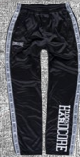
TRAINING PANTS ART.NR.: 315-001-050 SIZE: S-M-L-XL-XXL-XXXL