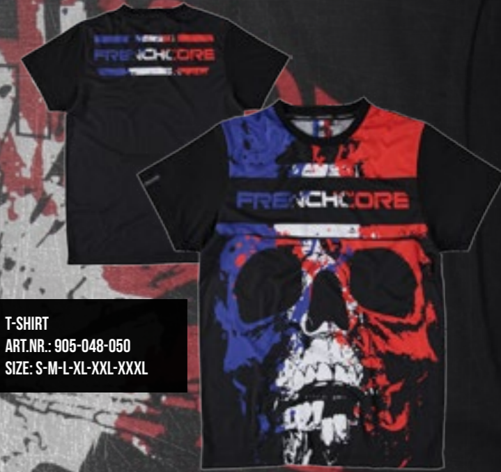
T-SHIRT ART.NR.: 905-048-050 SIZE: S-M-L-XL-XXL-XXXL