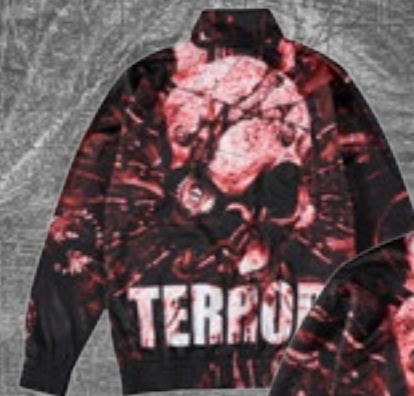
TRAINING JACKET ART.NR.: 814-008-150 SIZE: S-M-L-XL-XXL