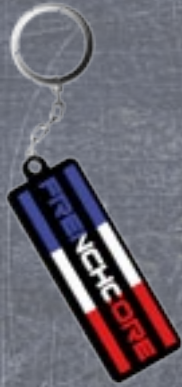
ART. NR.: 975-KC01-050