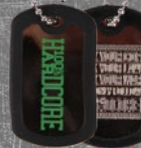
DOGTAG ART.NR.: HC-DT-400 SIZE: ONE SIZE