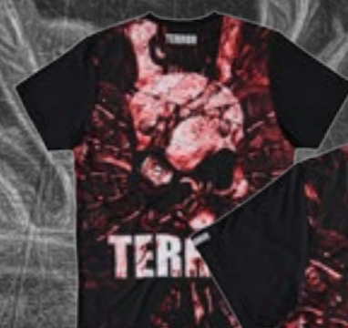
T-SHIRT ART.NR.: 805-037-150 SIZE: S-M-L-XL-XXL