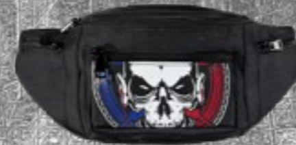
HIPBAG ART.NR.: 940-011-050 SIZE: ONE SIZE