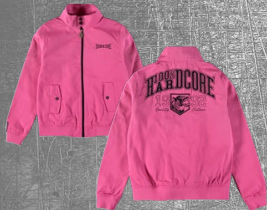
HARRINGTON JACKET ART.NR.: 358-012-160 SIZE: XS-S-M-L-XL