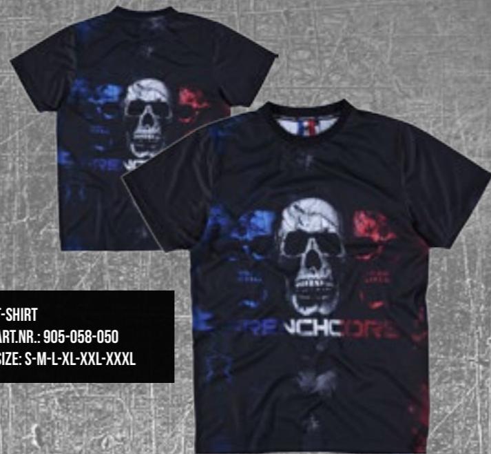
T-SHIRT ART.NR.: 905-058-050 SIZE: S-M-L-XL-XXL-XXXL