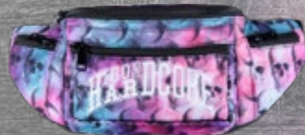
HIPBAG ART.NR.: 340-034-DREAM SIZE: ONE SIZE