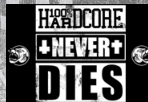
ART.NR.: 360-033-050 SIZE: 150 CM X 100 CM