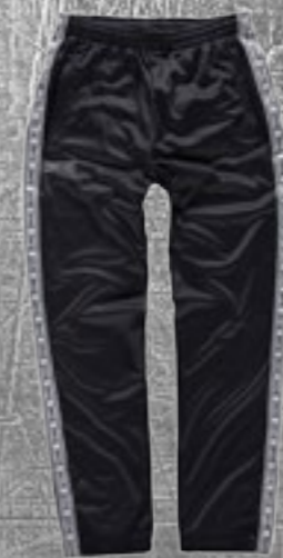
TRAINING PANTS GREY ART.NR.: 315-010-065 SIZE: XS-S-M-L