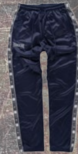
TRAINING PANTS NAVY ART.NR.: 315-010-230 SIZE: XS-S-M-L-XL