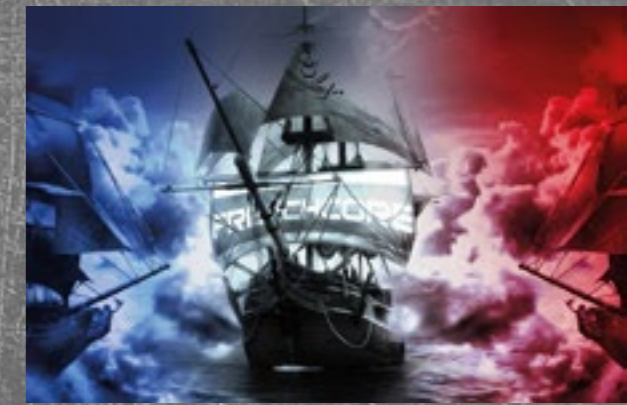
ART.NR.: 960-011-050 SIZE: 150 CM X 100 CM