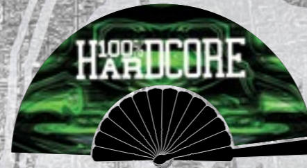
ART. NR.: 340-W21-400