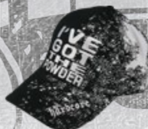
CAP ART.NR.: 330-C21-050 SIZE: ONE SIZE