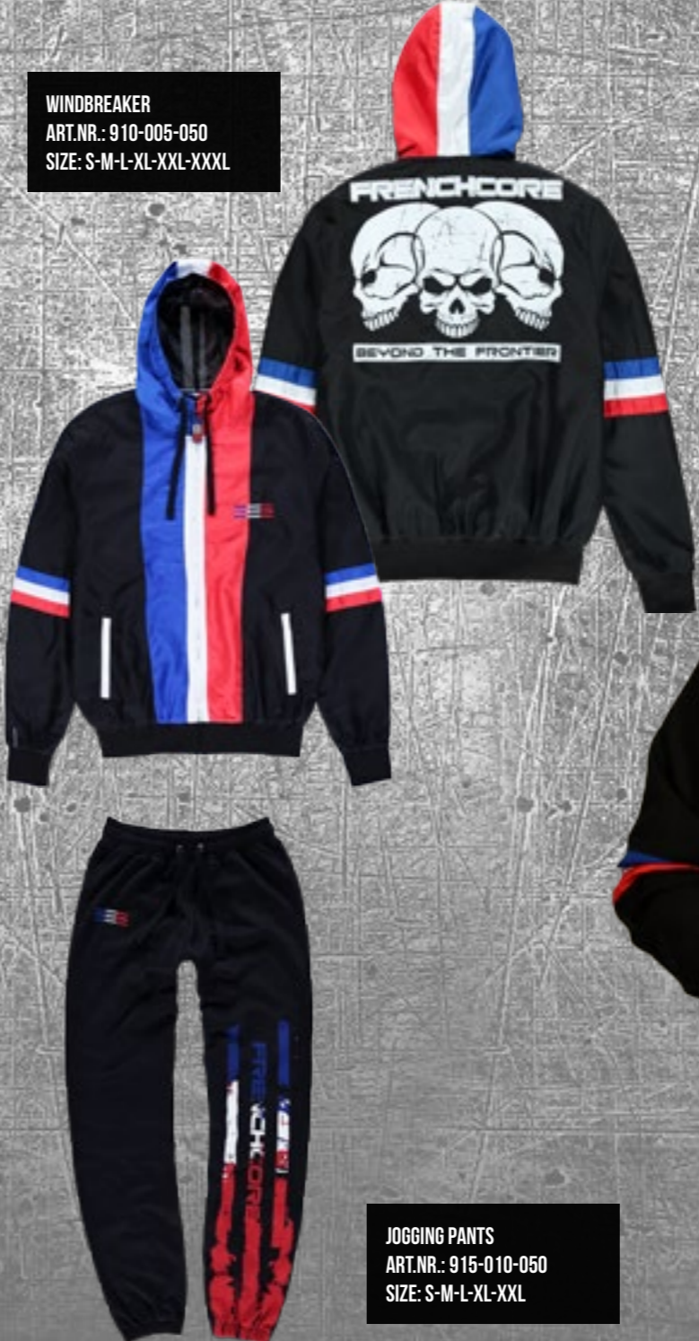
WINDBREAKER ART.NR.: 910-005-050 SIZE: S-M-L-XL-XXL-XXXL