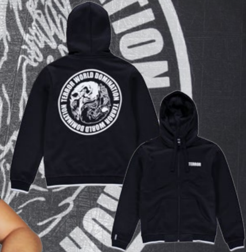
HOODED ZIPPER ART.NR.: 801-009-050 SIZE: S-M-L-XL-XXL-XXXL