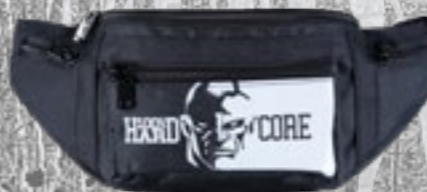
HIPBAG ART.NR.: 340-048-050 SIZE: ONE SIZE