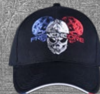
HIPBAG ART.NR.: 930-C16-050 SIZE: ONE SIZE