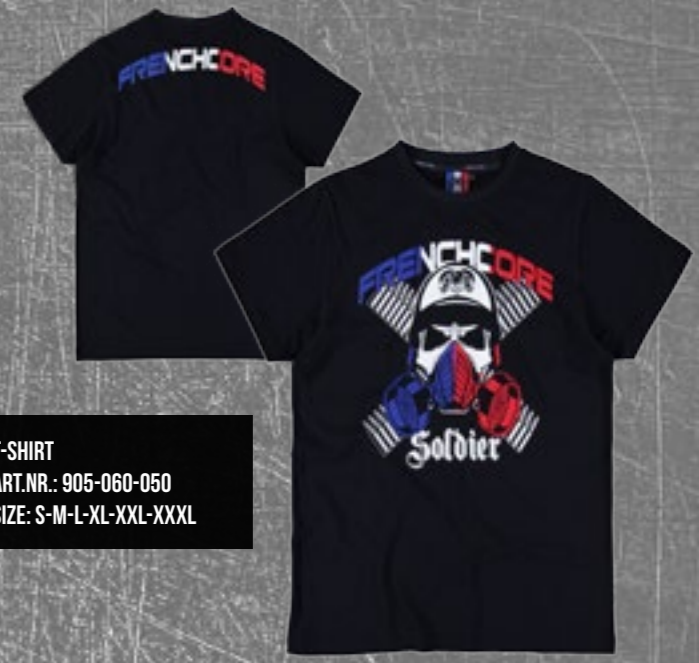
T-SHIRT ART.NR.: 905-060-050 SIZE: S-M-L-XL-XXL-XXXL