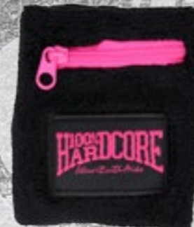
WRISTBAND 2-PACK ART.NR.: 350-006-160 SIZE: ONE SIZE