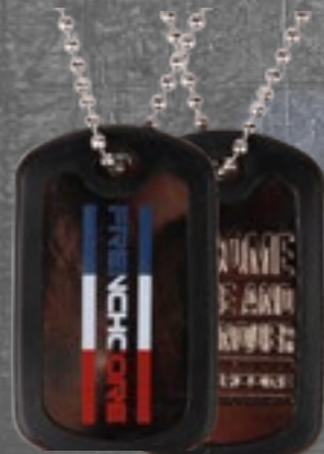
ART. NR.: FC-DT-001