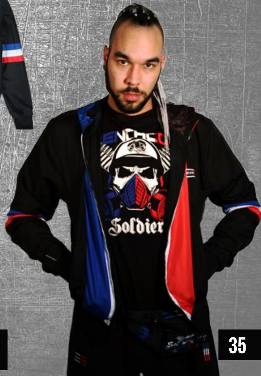
JOGGING PANTS ART.NR.: 915-010-050 SIZE: S-M-L-XL-XXL