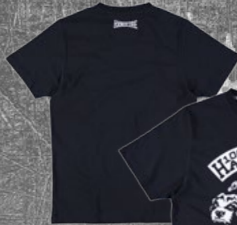
T-SHIRT ART.NR.: 305-250-050 SIZE: S-M-L-XL-XXL-XXXL