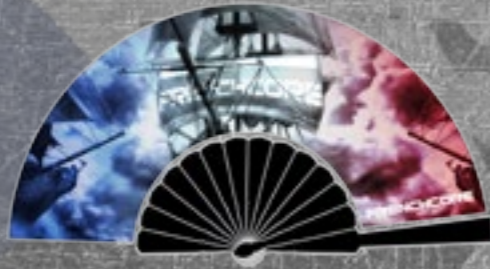
FAN ART.NR.: 940-W6-050 SIZE: ONE SIZE