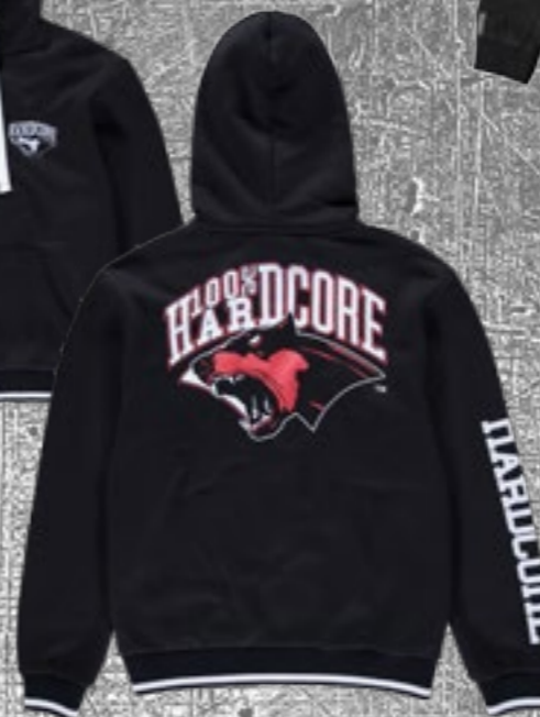
HOODED ZIPPER ART.NR.: 315-HZ01-050 SIZE: S-M-L-XL-XXL-XXXL