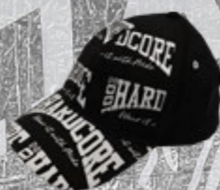
CAP ART.NR.: 330-C39-050 SIZE: ONE SIZE