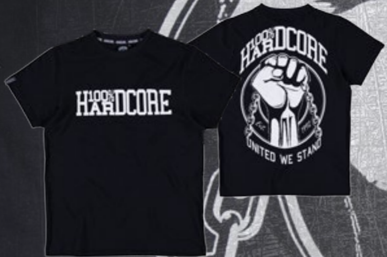
T-SHIRT ART.NR.: 305-240-050 SIZE: S-M-L-XL-XXL-XXXL