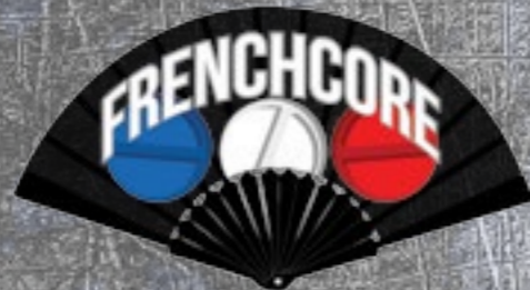
FAN ART.NR.: FC-FAN-002 SIZE: ONE SIZE