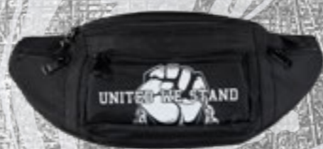
HIPBAG ART.NR.: 340-038-050 SIZE: ONE SIZE