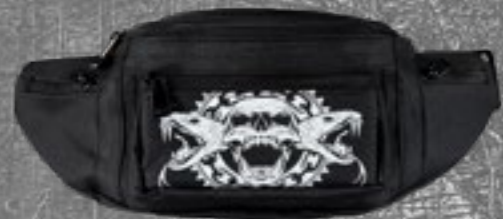
HIPBAG ART.NR.: 840-011-050 SIZE: ONE SIZE