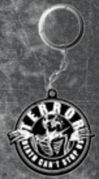
ART. NR.: 875-KC02-050