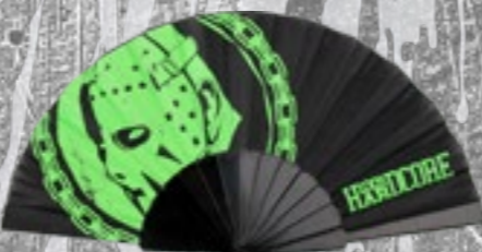
ART. NR.: 340-W19-400