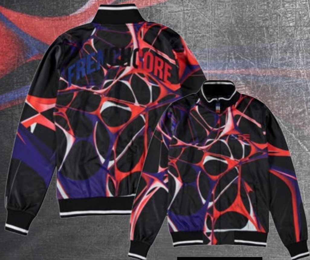
TRAINING JACKET ART.NR.: 951-002-050 SIZE: S-M-L-XL