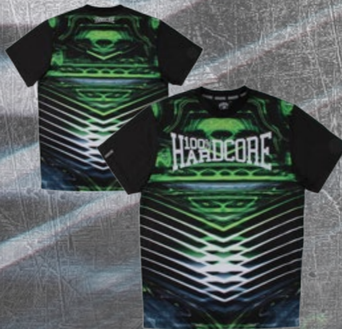
T-SHIRT ART.NR.: 305-214-400 SIZE: S-M-L-XL-XXL-XXXL