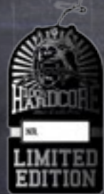
TRAINING JACKET ART.NR.: 314-103-200 SIZE: S-M-L-XL-XXL-XXXL