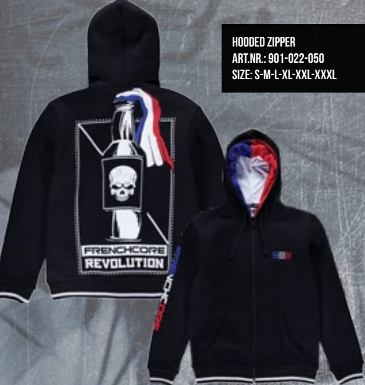
HOODED ZIPPER ART.NR.: 901-022-050 SIZE: S-M-L-XL-XXL-XXXL