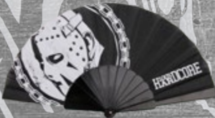
ART. NR.: 340-W19-050