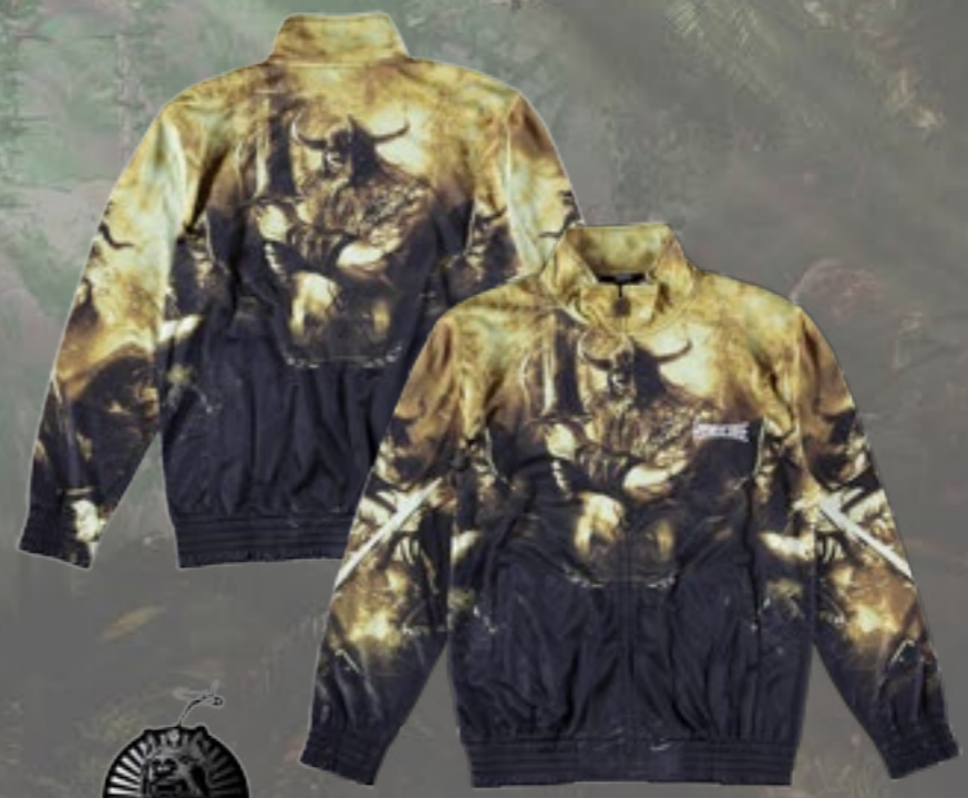
TRAINING JACKET ART.NR.: 314-099-200 SIZE: S-M-L-XL-XXL-XXXL