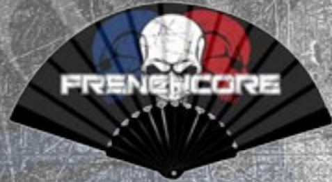
FAN ART.NR.: FC-FAN-001 SIZE: ONE SIZE