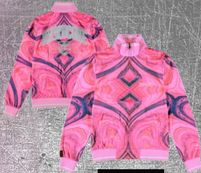
TRAINING JACKET ART.NR.: 351-TJ01-160PS SIZE: XS-S-M-L-XL-XXL