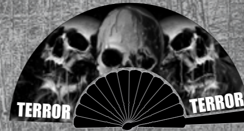
FAN ART.NR.: 840-W5-050 SIZE: ONE SIZE