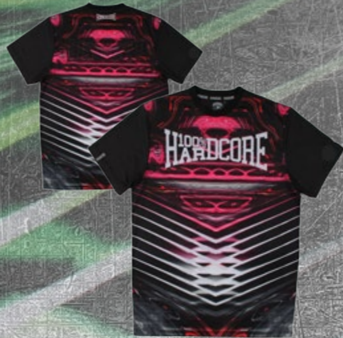
T-SHIRT ART.NR.: 305-214-160 SIZE: S-M-L-XL-XXL-XXXL