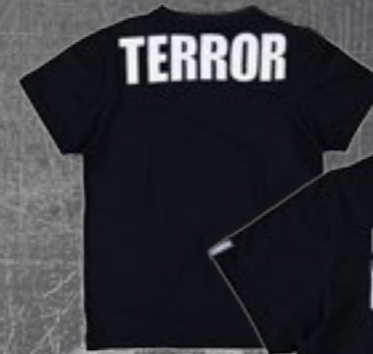
T-SHIRT ART.NR.: 805-039-050 SIZE: S-M-L-XL-XXL-XXXL