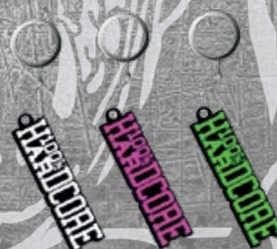
KEYCHAIN ART.NR.: 375-KC01-050 / 160 / 400 SIZE: ONE SIZE