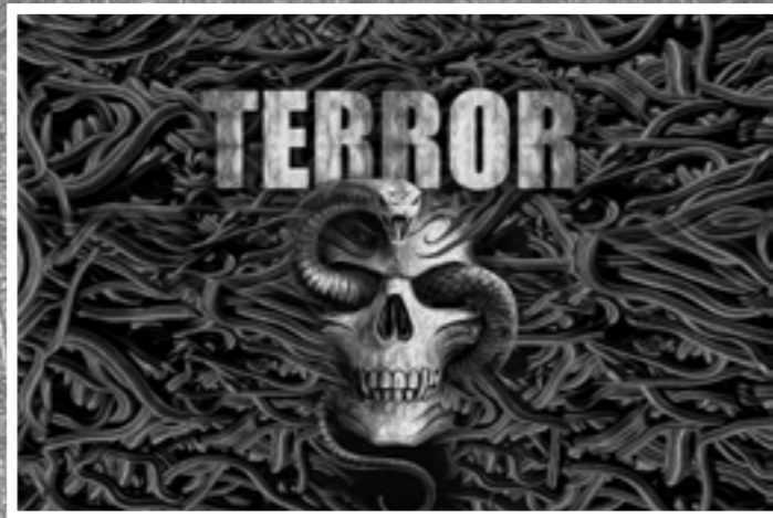
ART.NR.: 860-012-050 SIZE: 150 CM X 100 CM