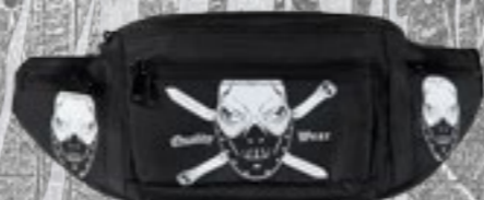
HIPBAG ART.NR.: 340-040-050 SIZE: ONE SIZE