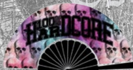
ART. NR.: 340-W21-DREAM