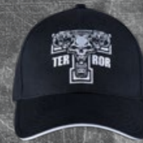
CAP ART.NR.: 830-C12-050 SIZE: ONE SIZE