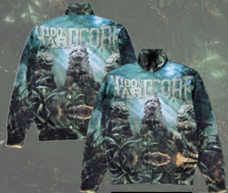
TRAINING JACKET ART.NR.: 314-101-050 SIZE: S-M-L-XL-XXL-XXXL