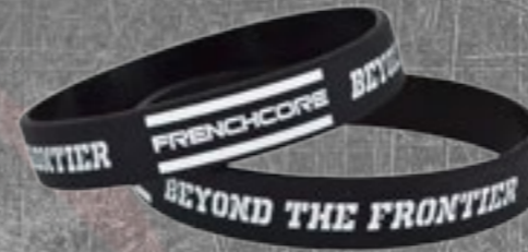
WRISTBAND ART.NR.: FC-WB01-050 SIZE: ONE SIZE