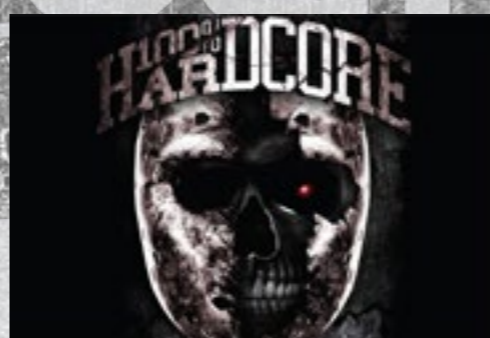
ART.NR.: 360-021-050 SIZE: 150 CM X 100 CM