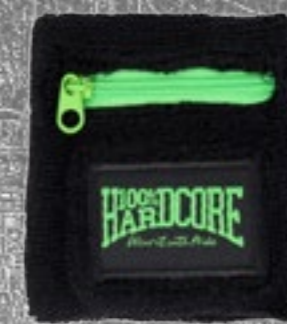
WRISTBAND 2-PACK ART.NR.: 350-006-400 SIZE: ONE SIZE