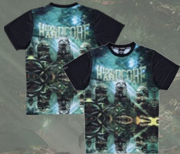
T-SHIRT ART.NR.: 305-242-050 SIZE: S-M-L-XL-XXL-XXXL