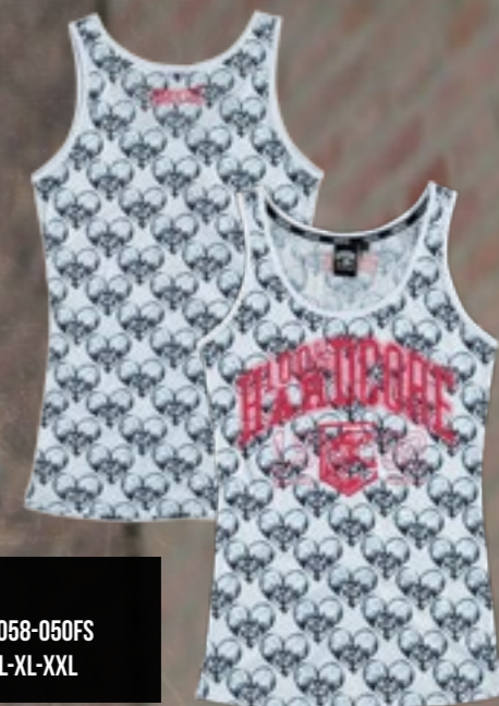
SINGLET ART.NR.: 355-058-050FS SIZE: XS-S-M-L-XL-XXL