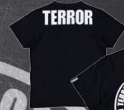
T-SHIRT ART.NR.: 805-041-050 SIZE: S-M-L-XL-XXL-XXXL