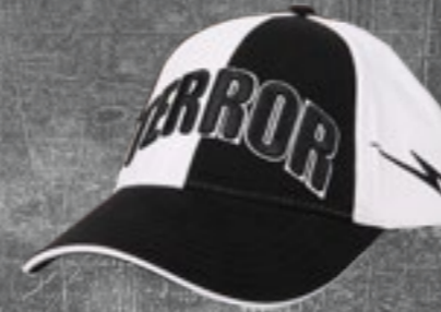
CAP ART.NR.: 830-C04-050 SIZE: ONE SIZE