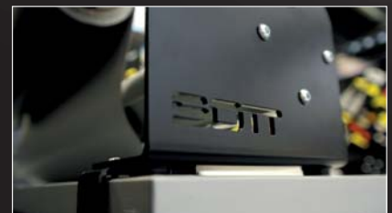
Has a perfect and safe finish thanks to its coated, solid metal build and rounded corners.