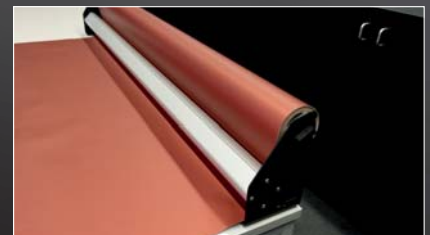
The stable dispenser construction enables the perfect unrolling of wide film rolls, such as carwrap films, without any kinks or creases.