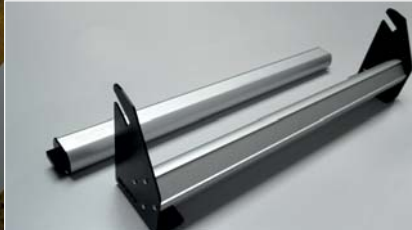
Simply and quickly slide the roll guide into the special position slots.