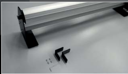
The dispenser comes complete with mounting brackets, screws and an Allen key. Just put it together and it's ready for use.