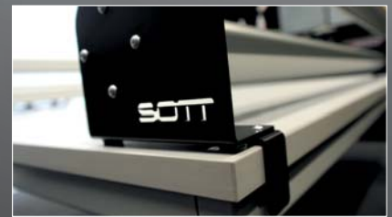
Corner brackets that can be mounted as needed so the dispenser "clamps" onto the table are included.