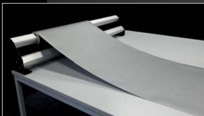
The two aluminium roller guides enable you to unroll your vinyl or application tape either from the top or the bottom.