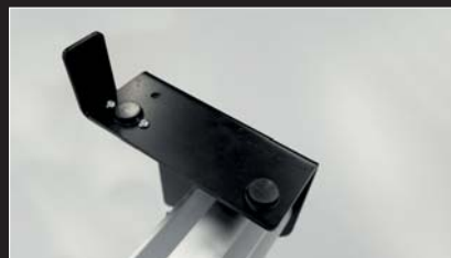
Rubber feet ensure it solidly sits on your table and they prevent damage. The dispenser can also be bolted to the table. A screw hole is provided for that purpose.