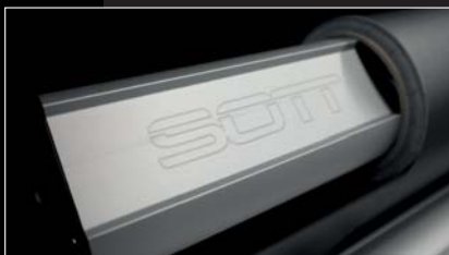
The roller guides are made from anodised aluminium with a metal profile along their entire length to prevent sagging