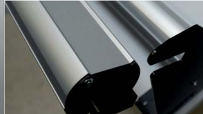
Perfectly finished endcaps smoothly slide into the position slots. This stabilizes the dispenser even more.