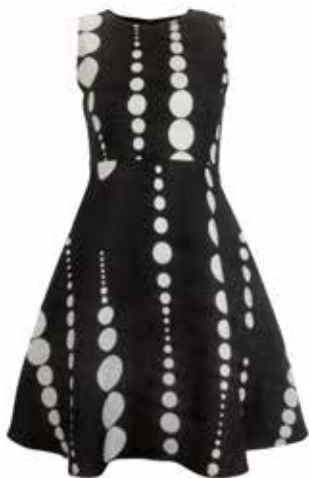
Dress Xelly VLR-71296