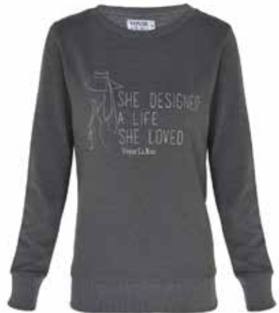
Sweater SHE VLR-75533