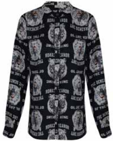
Blouse Xana Tiger VLR-70488