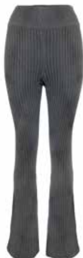
Pants Lana VLR-72345