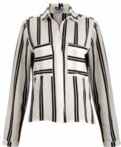
Stripe Blake Blouse VLR-71292