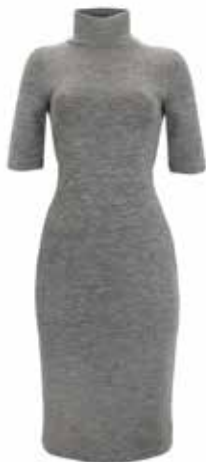
Dress Lois VLR-70500