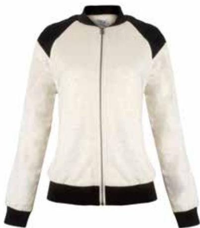
Balou Bomber VLR-70485