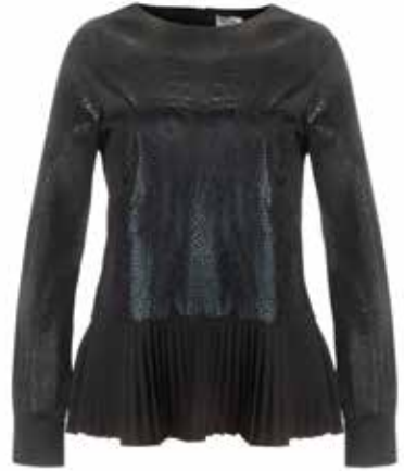
Jazzlyn Blouse VLR-70516