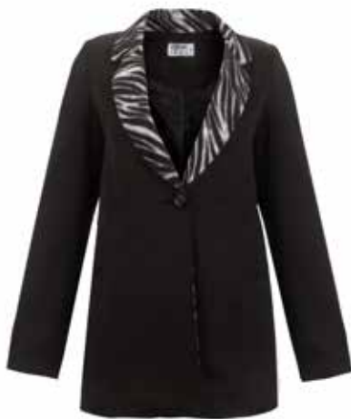
Colbert Zebra VLR-70512