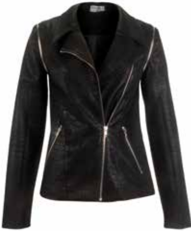
Xing Biker Jacket VLR-70505