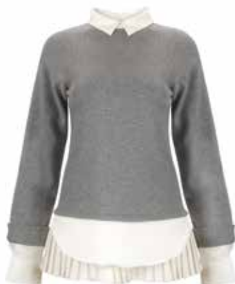
Jacey Blouse VLR-70507