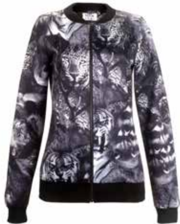
Bomber Jahfaria VLR-70515