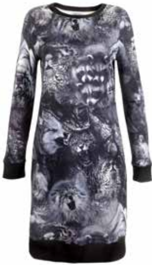
Dress Jahfaria VLR-70514