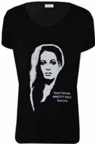
Tshirt Boss VLR-77743