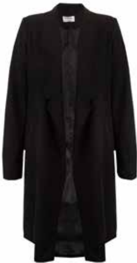
Jacket Yott VLR-71294