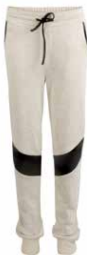
Balou jogging VLR-70503