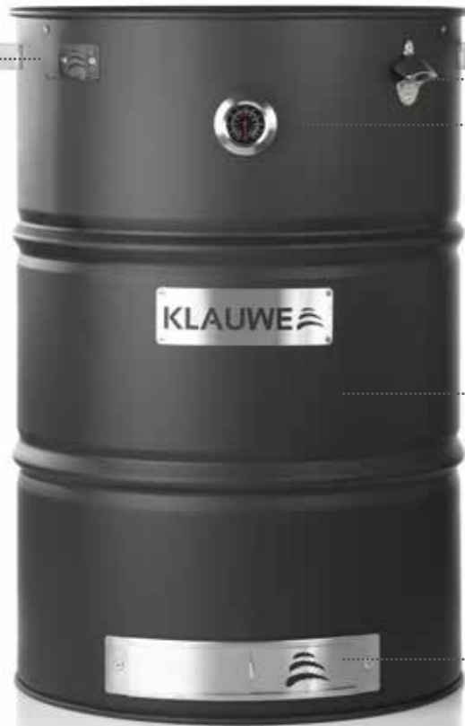
Powder coating inside and outside