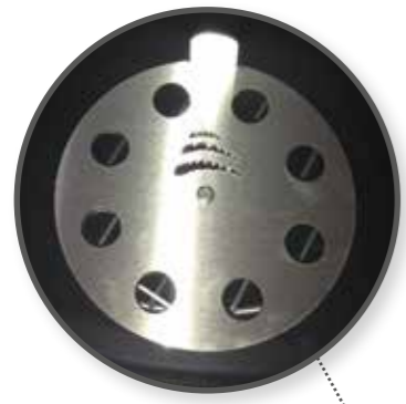
Stainless steel air vent