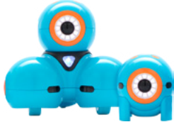
Dash & Dot $229.99