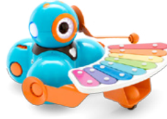
Dash's Xylophone $39.99