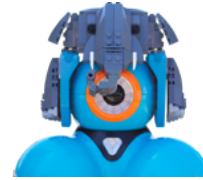
Building Brick Connectors $19.99