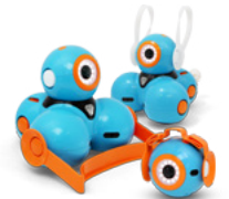
Accessories Pack $39.99