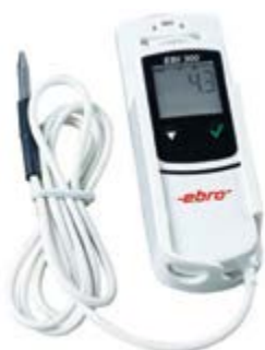
EBI 300 TE + EBI 300 WM2