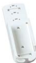
EBI 300-WM2 Wall Mount for EBI 300 / 310