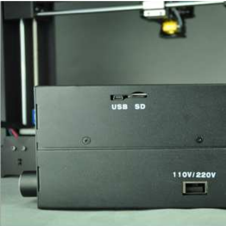
Initial Hardware Setup.

Now, set the Spool holder on the control box. Insert 2 screws through the 2 holes of spool holder stand . Lock the 2 screws onto the stand. Then insert the filament spool holder through the stand hole and lock it by 2 plastic nuts.