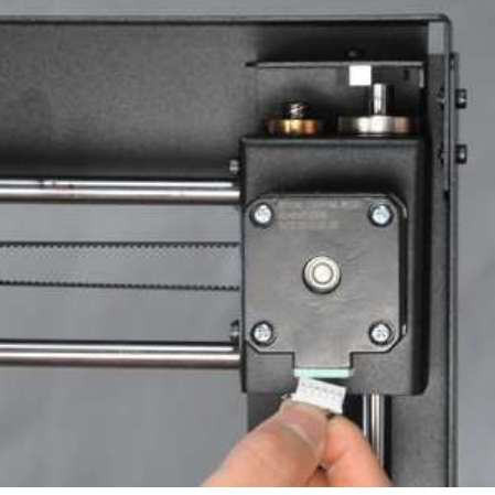
Wanhao I3 unboxing and hardware set up. Rev.A