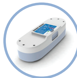
Inogen One ® G3 16 Cell Lithium Ion Battery** up to 9 hours run time