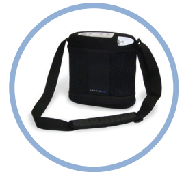
Inogen One ® G3 Carry Bag*