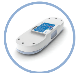
Inogen One ® G3 8 Cell Lithium Ion Battery** up to 4.5 hours run time