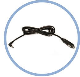
Inogen One ® G3 DC Power Cable*