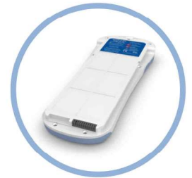
Inogen One® G2 12-Cell Lithium Ion Battery* Item #BA-200