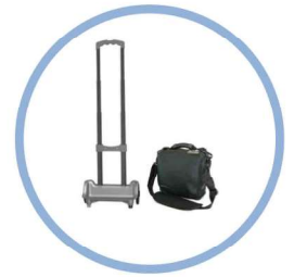
Inogen One® G2 Cart & Carry Bag* Item # CA-200