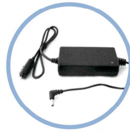
Inogen One® G2 DC Power Supply* Item # BA-302