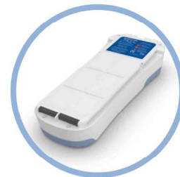
Inogen One® G2 24-Cell Lithium Ion Battery** Item #BA-224