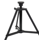
AT-220 Antenna Tripod