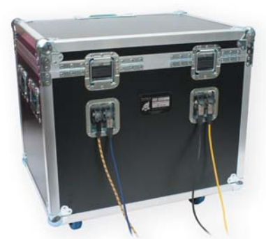
Rear panel: 3x XLR microphone connectors and 1x 1/4" jack for speaker cable connection.

The origin of the pro version goes back to 2008, when the first prototype was