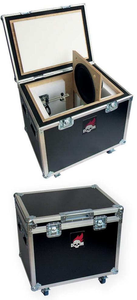
The rugged, flightcase based design meets all the standards for professional use.