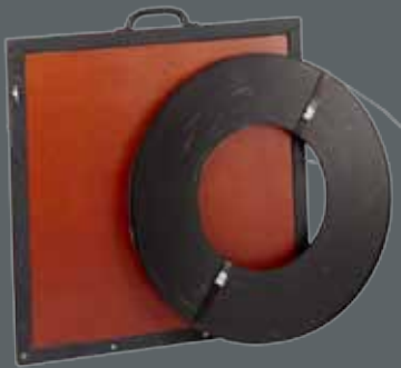
Steel band with holding case and sealing clips

The sealer is a light tool with handles which are held perpendicular to the strapping, producing a 1 up notch type seal. Because the strength of this type seal derives primarily from the shearing of the metal rather than from frictional forces, it provides a secure joint on slippery waxed strapping.