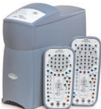
Alice LDx system with LDxS and LDxN head box.

Sleepware G3 features an exclusive composite channel type, useful when titrating complex sleep apnea patients with the BiPAP autoSV Advanced. The channel integrates the various parameters available from the BiPAP autoSV so a clinician can see the relationships of the various parameters on a breath-to-breath basis. Additionally this composite channel allows the clinician to eliminate the redundant channels from view which provides them with better screen visibility to all of the data.