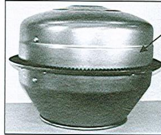
6 Trommel kompl.