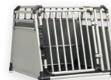
ProLine Condor //large