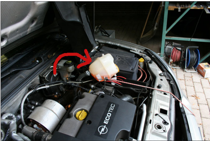
Remove coolant housing. (leave hoses connected)

Fitting guide for 4H-TECH F35-Shift Short Shifter for F35 transmissions.