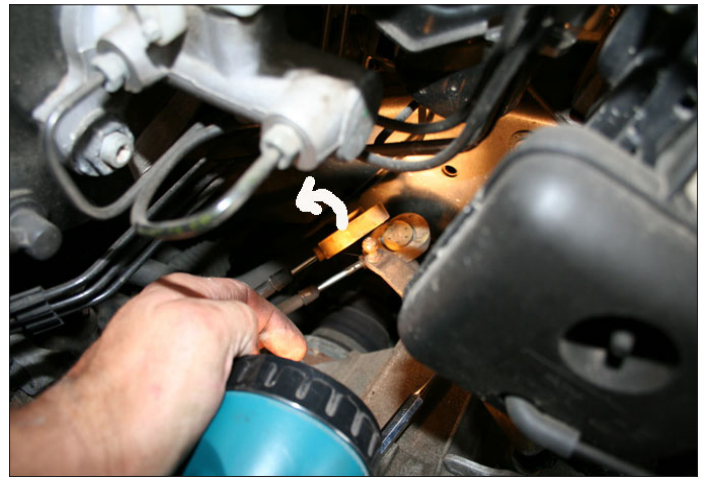
Unlock shift cable from the stock shifter