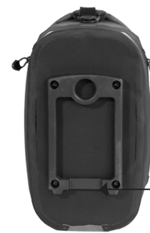
ORTLIEB mounting plate