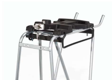
ORTLIEB rack adapter