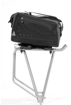
ORTLIEB-Trunk-Bag on rack adapter