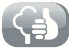
Environmental friendly (carbon neutral)