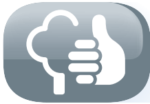
Environmental friendly (carbon neutral)