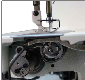
SYSTEM OF REGULATION OF HEIGHT AND ANGLE OF FEED DOG