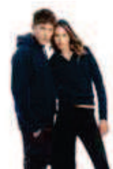
B&C Hooded & B&C Cat /women