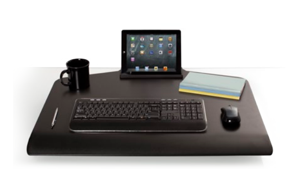
Expansive work surface features a storage tray —keeps items within reach.