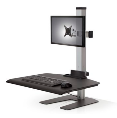
Single monitor option available.