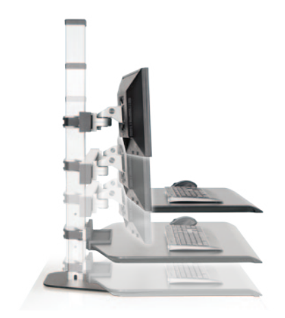
Seamless height adjustment.