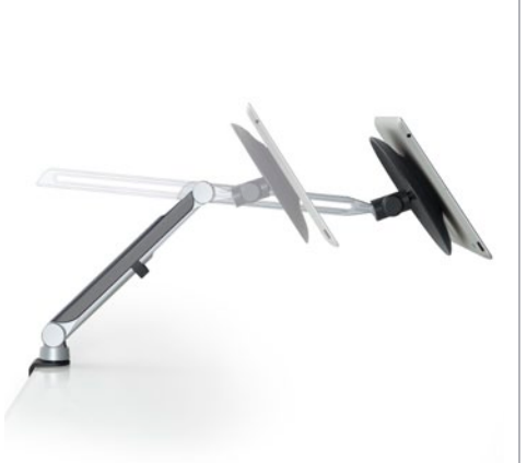
Flexible extension arm.