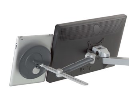
VESA mount option available for dual screen computing.