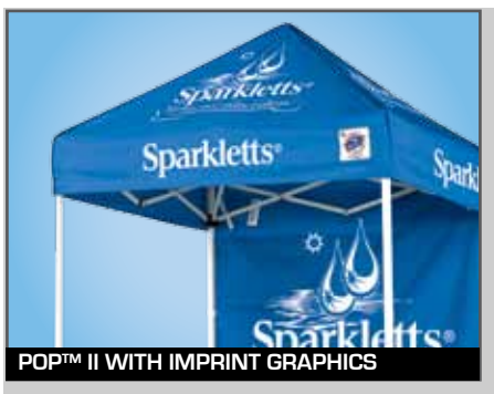
POP™ II WITH IMPRINT GRAPHICS