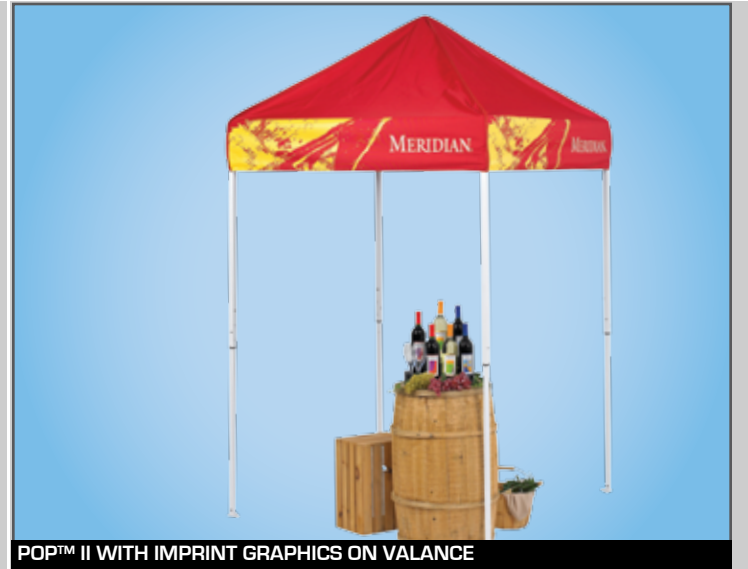
POP™ II WITH IMPRINT GRAPHICS ON VALANCE

In-Store Displays Rental Industry Information Booths Portable Signage Changing Rooms Catering Events Instant Signage Point-of-Purchase Catering End-Cap Displays Indoor & Outdoor Display Exhibits Sponsorship Recognition Sample Giveaways Party Rentals Commercial Use Racing Product Demonstrations