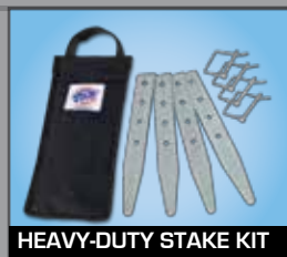
HEAVY-DUTY STAKE KIT