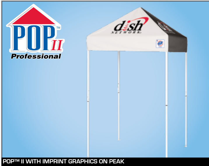
POP™ II WITH IMPRINT GRAPHICS ON PEAK

The POP™ II Professional shelter is the perfect promotional tool to maximize branding when space is limited. Especially designed for extended use and multiple set up both indoors and outdoors, the 5' x 5' (1.5 m x 1.5 m) footprint makes this shelter practical for smaller applications.