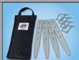
HEAVY-DUTY STAKE KIT