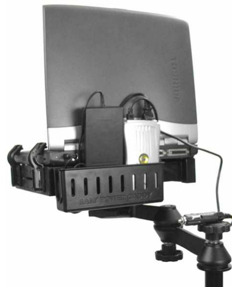
RAM-234-3 UNIVERSAL LAPTOP TRAY SHOWN WITH COMPUTER AND OPTIONAL #RAM-234-5 POWER CADDY FOR HOLDING VARIOUS AFTERMARKET POWER SUPPLIES

RAM is the revolutionary universal mounting system that allows you to mount practically anything anywhere. Whether its in a boat, aircraft, automobile, ATV, motorcycle or any other situation, RAM's family of over 800 interchangeable accessories will offer you solutions to your most challenging mounting problems. If you need to mount a radar, sonar, GPS, computer, cellular phone, antenna, or just about anything else look no further. RAM mounts will help you make a professional job easy and affordable. They will allow you to reposition or remove your electronics for perfect viewing or safe keeping. It's unique design provides easy installation, mobility, strength, versatility, vibration protection and durability, all at a low cost. RAM is backed by NPI's renowned Lifetime Warranty which makes it the mounting system of choice. To provide light weight strength and corrosion resistance, RAM is made of marine grade aluminum with a powder coated finish, stainless steel hardware and rubber balls. Visit the RAM web site at: www.ram-mount.com to see the newest products and to learn more about this revolutionary mounting system.